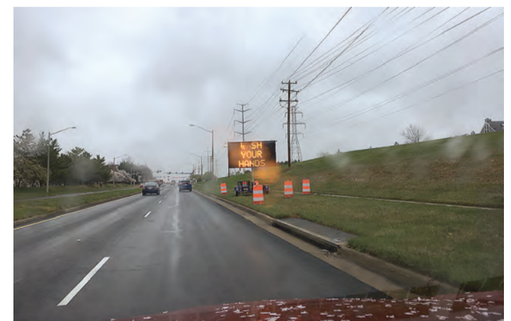
A variable message sign in Kingstowne reminded everyone to wash their hands.