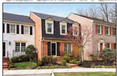
West Springfield • Rhygate • $529,900

Our Buyers are Buying and Our Homes Are Selling! Demand is Still High and Inventory Remains Low! Call Us Today to Discuss Your Real Estate Needs.