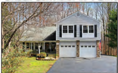
Manassas • Updated • $524,900