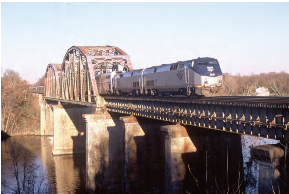
The train and car-carriers go over the Occoquan River each day.