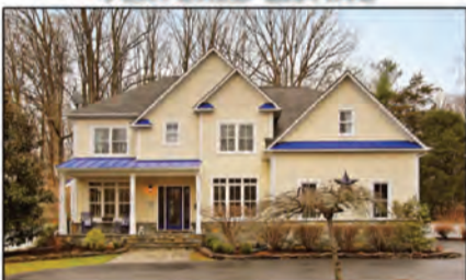
Clifton • Custom Farm House • $1,149,900