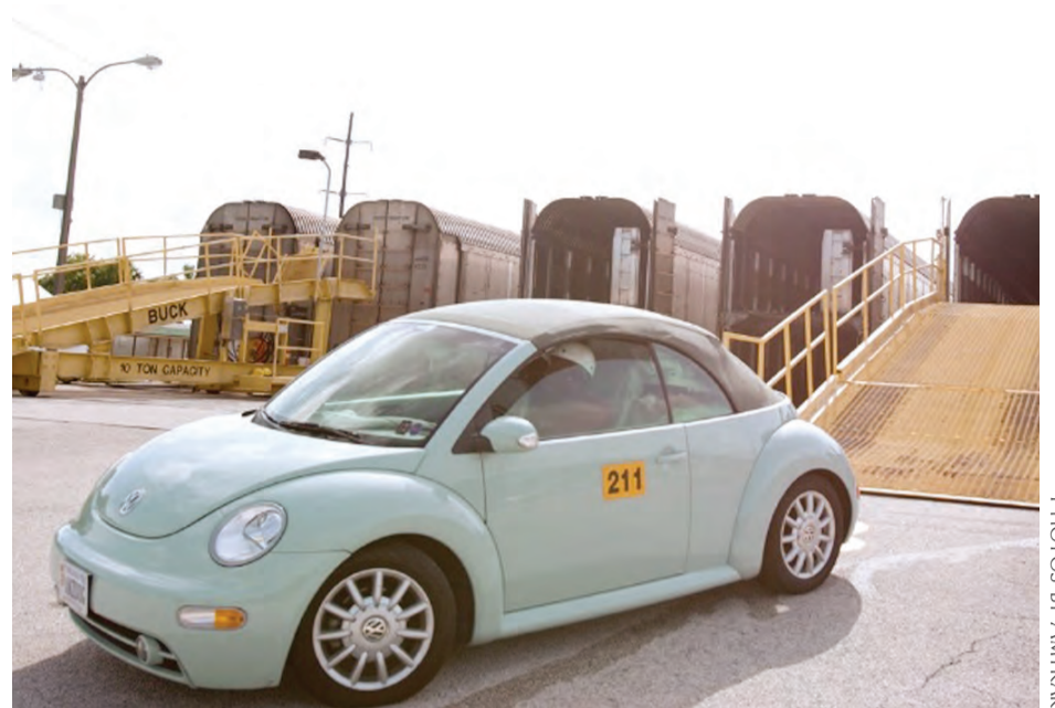
Loading and unloading the cars is just part of the whole experience.