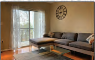
Fairfax • Condo • $209,900