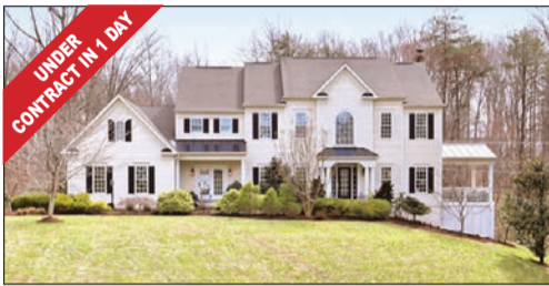
Clifton - $1,025,000

Office: 703-503-1881 ShelleyD@LNF.com Cyndee@LNF.com Your Home. Our Priority!