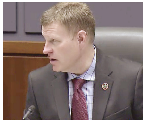
Chairman of the Fairfax County Board of Supervisors Jeffery McKay

The Updated Budget Proposal cut nearly all new spending. It eliminated all pay adjustments for County employees. Hill wrote,