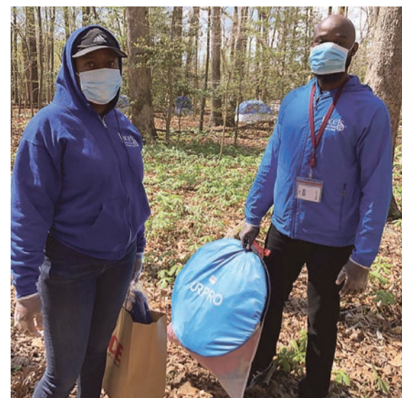
FACETS case manager and medical outreach worker going into the woods to provide medical screenings and advice to clients about protecting themselves.