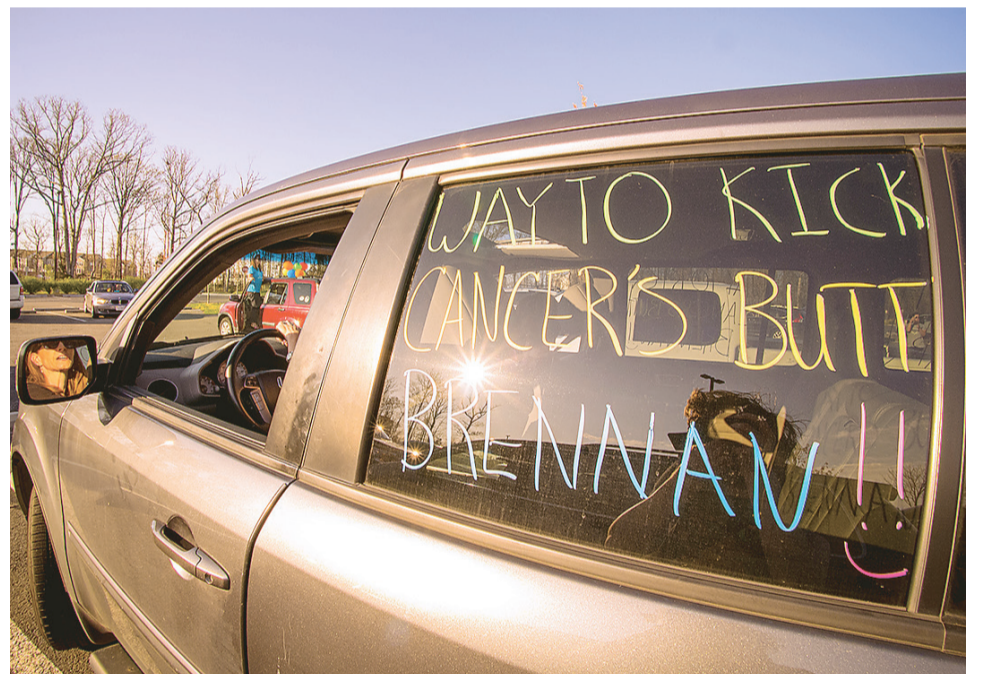
One of the encouraging messages written on a car in the procession.

He said prayer and reading his Bible have been key to keeping down his stress and anxiety. In addition, he's made two, separate, to-do lists nearly every day. One is for things he'd like to accomplish, such as work