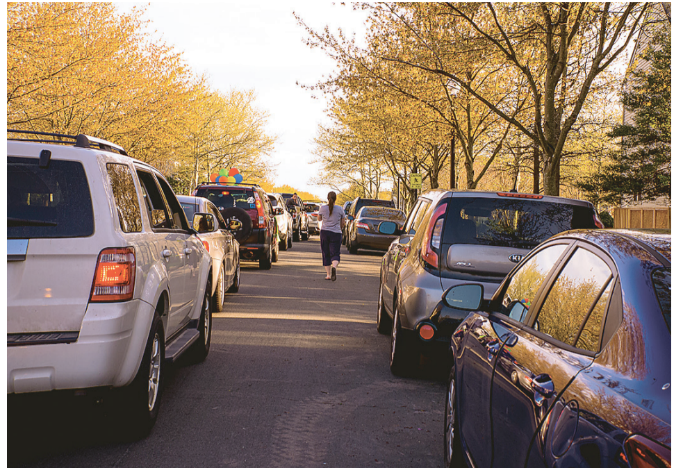
New Life Christian Church members drive by their pastor's home to show support.