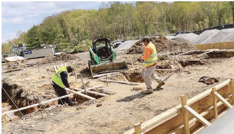
Workers prepare for pouring cement footings.