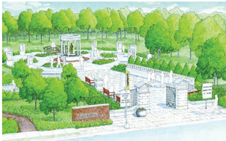
Architect's rendering illustrates Turning Point Suffragist Memorial plan before cost cutting changes.