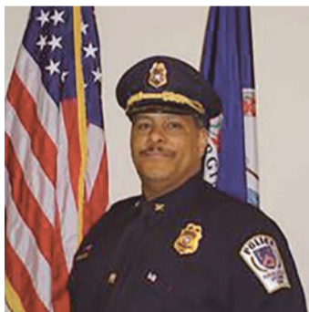
HERNDON POLICE FACEBOOK PAGE