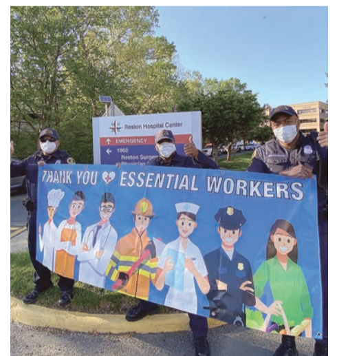
Virginia State Police give thumbs up and thank you to all essential workers at Reston Hospital Center.