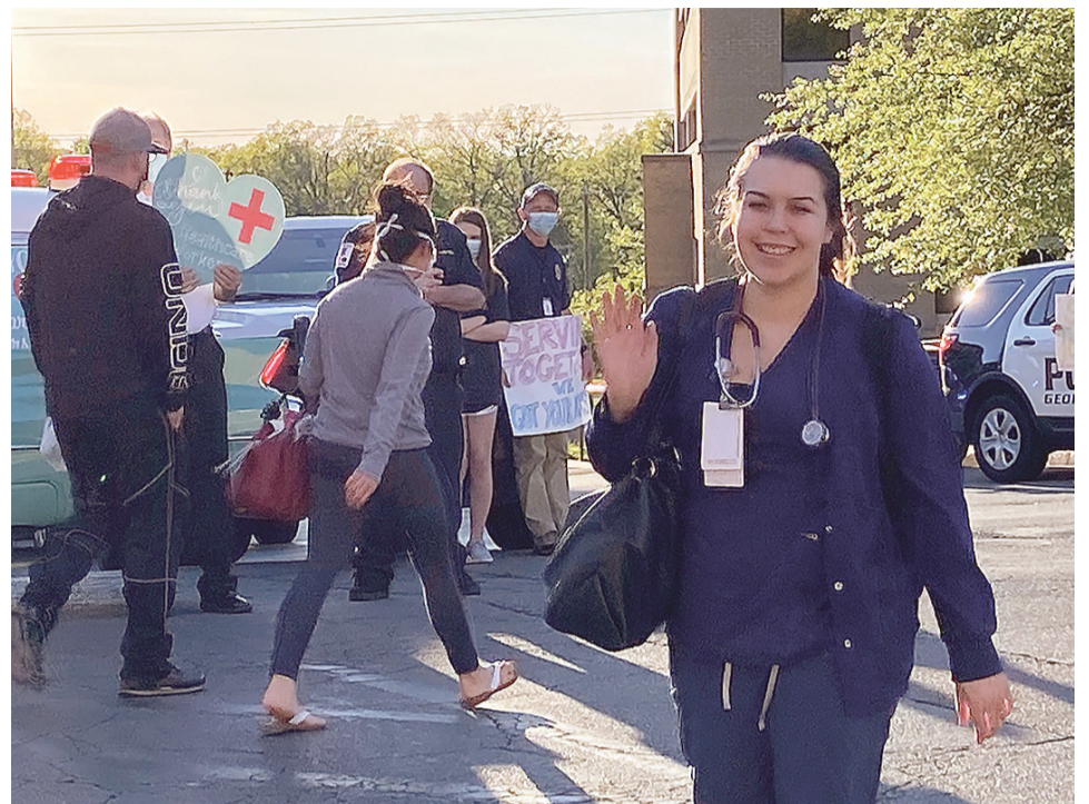
Local police, fire and rescue agencies recognize and celebrate nurses and health care workers at Reston Hospital Center in anticipation of National Nurses Week, May 6-12 and Hospital Week, May 10-16, 2020.