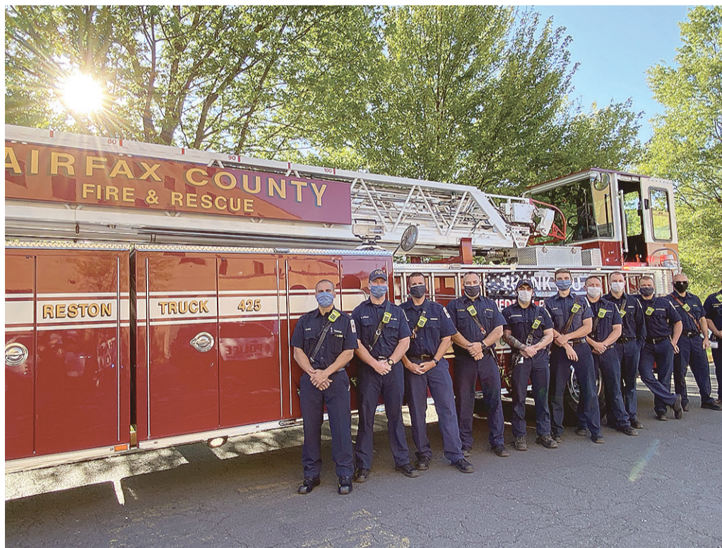
Fairfax County Fire Station 425 Reston prepares to lead the parade procession.