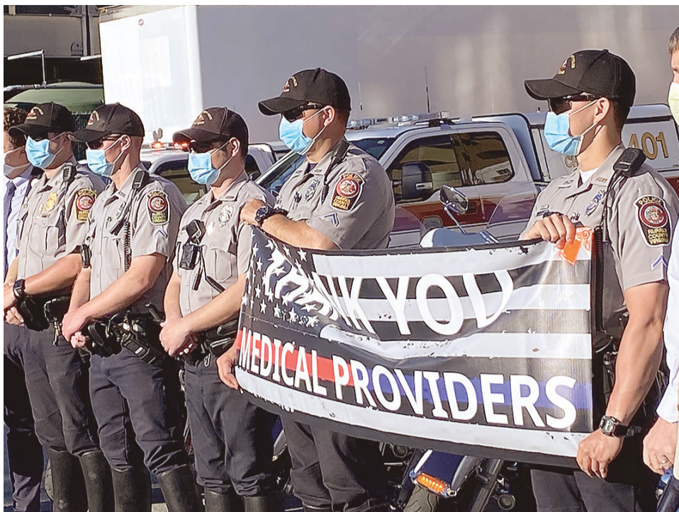
The Fairfax County Police Motor Squad holds up their banner of appreciation to medical providers at Reston Hospital Center.