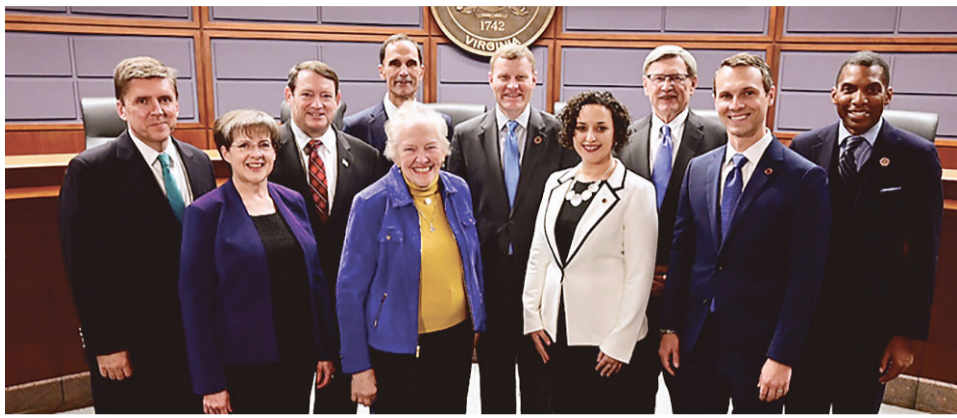
Fairfax County Board of Supervisors.