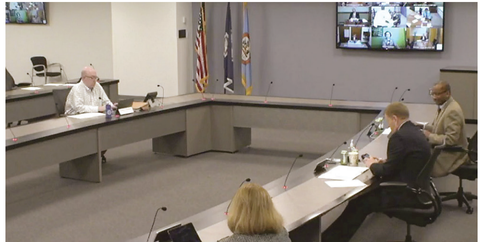
Fairfax County Board of Supervisors and staff meet socially distanced and remotely for the Wednesday, April 29 public hearing on the revised fiscal year (FY) 2021 budget proposal before them.