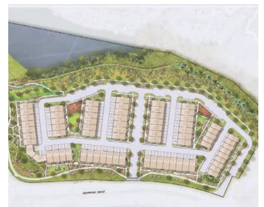
Site Plan of the proposed Stonebrook residential community.