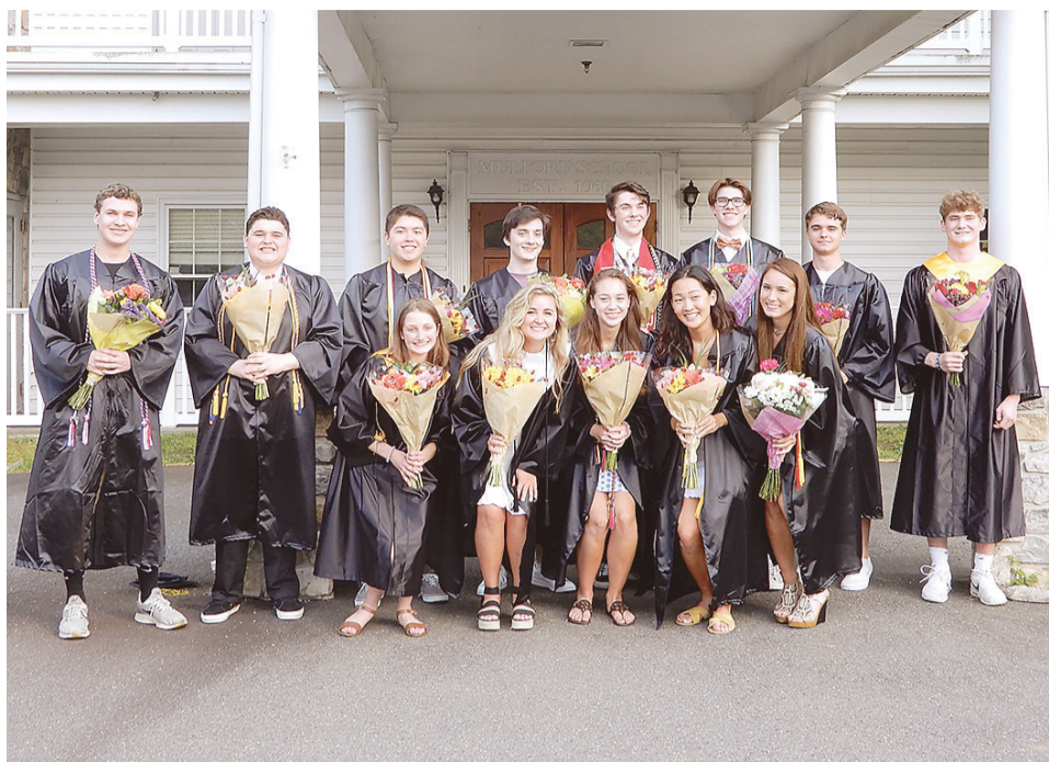
The 13 graduates gather for a group photo before the parade in Centreville.