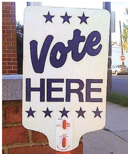
The Republican primary is June 23. The deadline to submit an application for an absentee ballot is June 16.

"Right now all they have to do is report their transactions, which is how we knew about the fire sale of stocks," he said. "It ba-