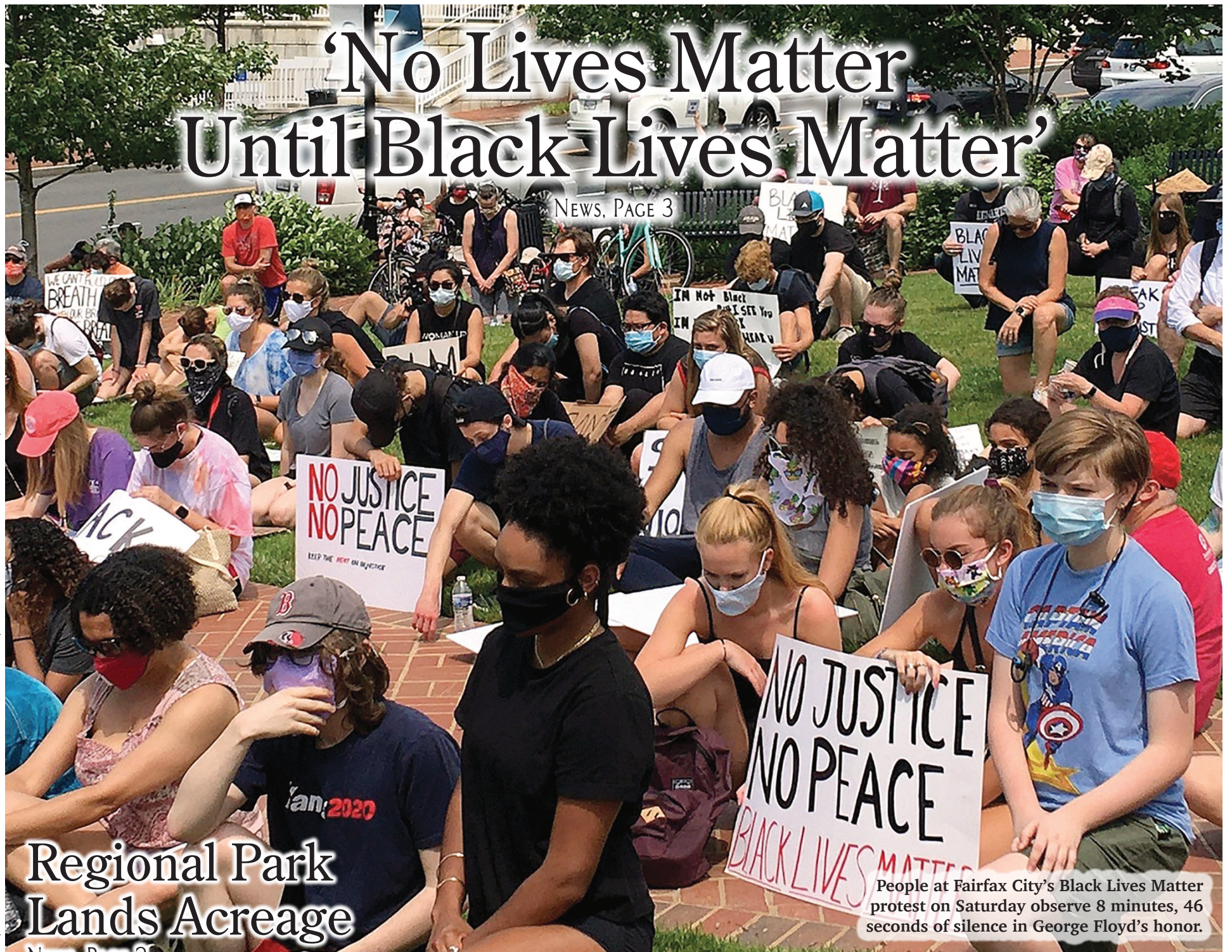
People at Fairfax City's Black Lives Matter protest on Saturday observe 8 minutes, 46 seconds of silence in George Floyd's honor.