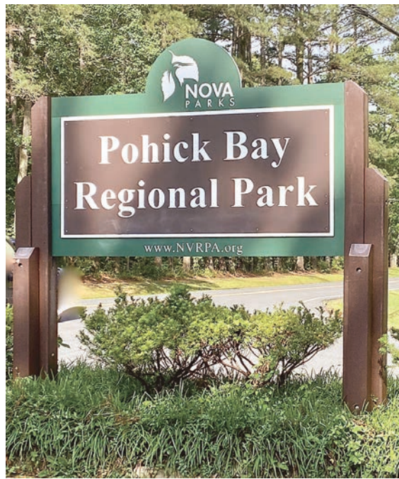
Pohick Bay Park acquires land for conservation.

The Regional Park system on the southern border of Fairfax County encompasses approximately 34 miles of nearly contiguous parkland. Beginning at Bull