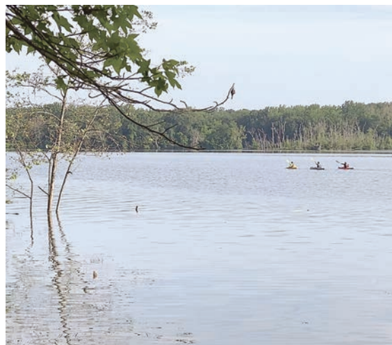
Kayakers enjoy the paddling in Pohick Bay Regional Park.

Run Regional, park land continues through Hemlock, Fountainhead and Sandy Run, a scholastic rowing facility, for a 20 mile, 4,000 acre block of parkland. After a gap with the Vulcan Quarry, Fairfax County Water, and a few private residences, the Occoquan Regional Park begins, running along the river shoreline. NOVA Parks notes that park usage has increased substantially since the pandemic as citizens seek exercise and relief in the park system's natural settings.