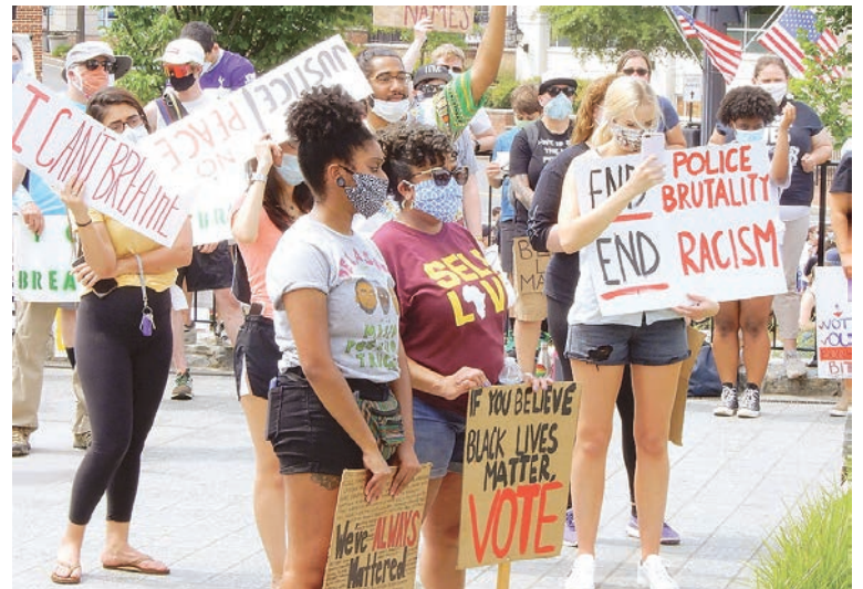
Heartfelt sentiments are written on these protest participants’ signs.

lost (adj): 1. unable to find the way. 2. not appreciated or understood. 3. no longer owned or known