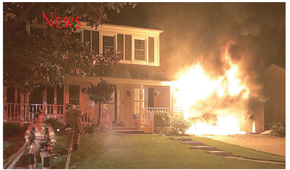
FAIRFAX COUNTY FIRE & RESCUE DEPT.

Flames are pouring out of this Franklin Farm garage.