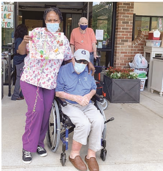
A Paul Spring Retirement Community staff member and resident show off a thank you sign from Synergy Home Care in appreciation for the facility's commitment and caring during the COVID-19 pandemic.