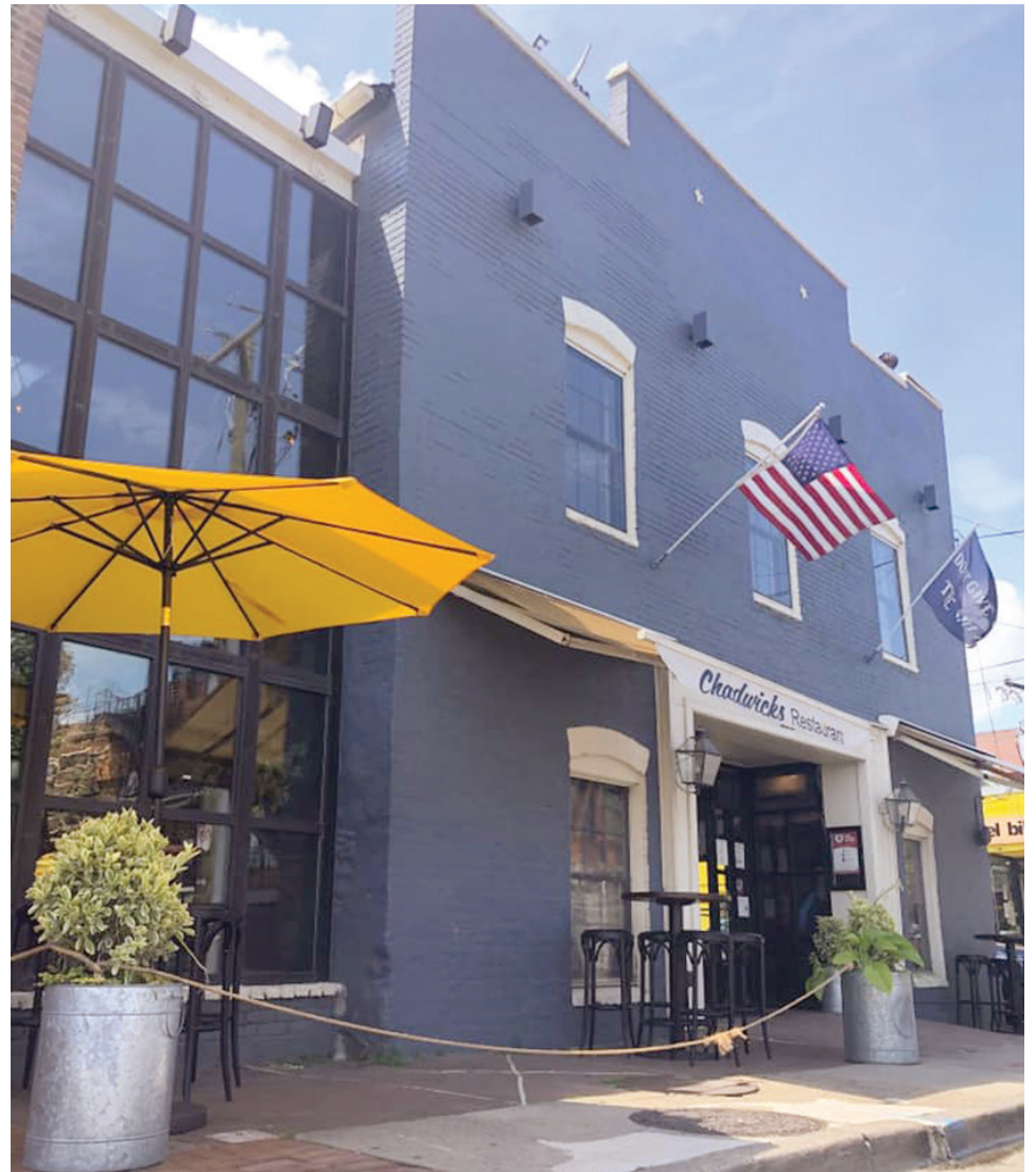
Dining is available inside at Chadwicks now. "Standing, mask. Sitting, no mask. If you don't want to wear a mask you should stay home, we deliver."