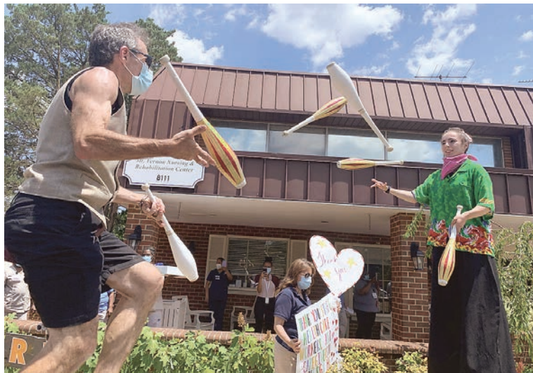
A duo of jugglers entertains staff at Mount Vernon Nursing and Rehabilitation June 30 as part of a show of appreciation by Synergy Home Care for health care providers during the COVID-19 pandemic.