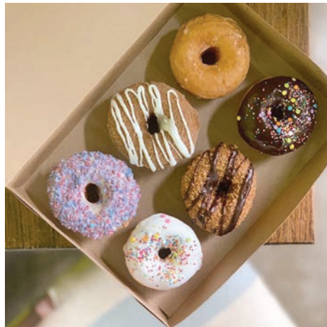
Donuts at Elizabeth's Counter

"We are still offering carryout/ curbside dining and delivery. We encourage anyone with health concerns to stay home and we will bring dinner to your door. Check our website ( chadwicksoldtown.com ) or call us (703.836.4442)."