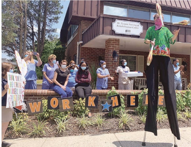
Mount Vernon Nursing and Rehabilitation Center staff watch a juggler brought to the facility June 30 by Synergy Home Care in a show of appreciation for their dedication during the COVID-19 pandemic.