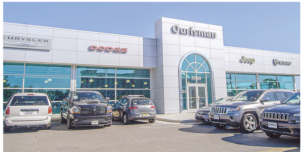
With Covid-19 giving rise to changes in buying automobiles, some economists say auto sales may decline by 20% in 2020. The Ourisman dealerships on Richmond Highway are ready to provide service for your vehicle along with their customer-oriented sales teams.