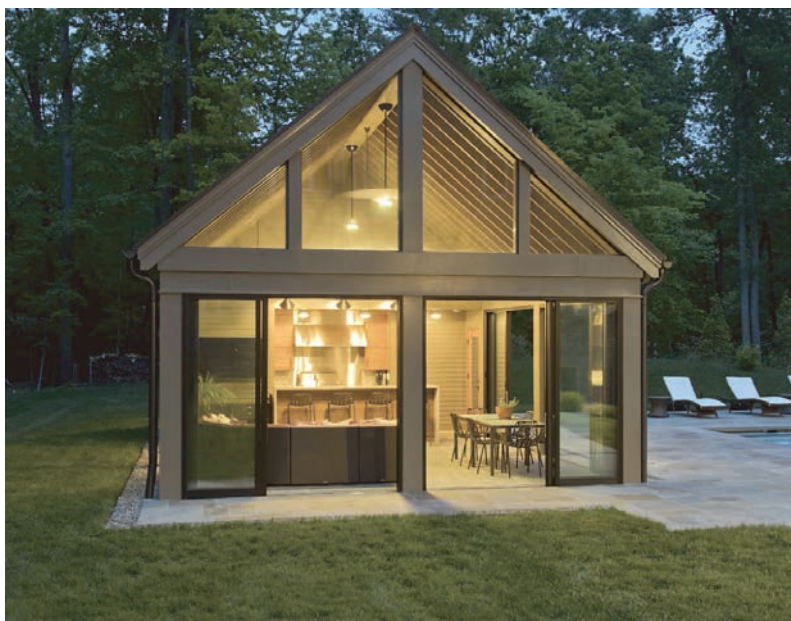
Three of the four walls of the pool house are made of glass and give the space a rustic feel.

Transforming the expansive backyard into a summer oasis by designing a pool and adjacent pool house.