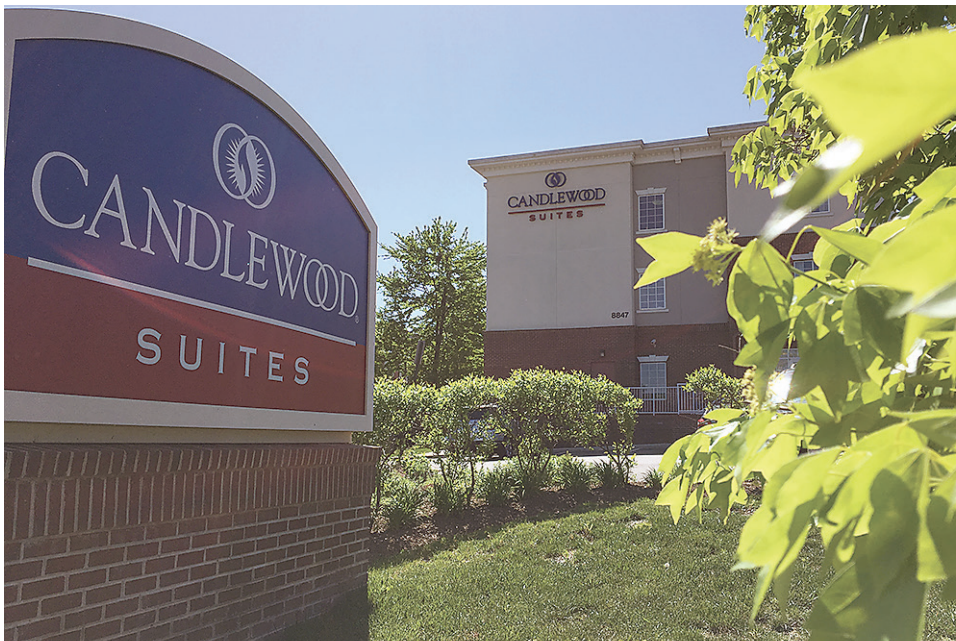
Candlewood Suites and other local hotels, bucking national and global trends, have remained open during the pandemic. New sanitation procedures are keeping guests safe.