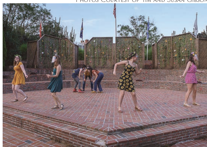
Actors rehearse a scene from City of Fairfax Theatre Co.'s "A Midsummer Night's Dream."