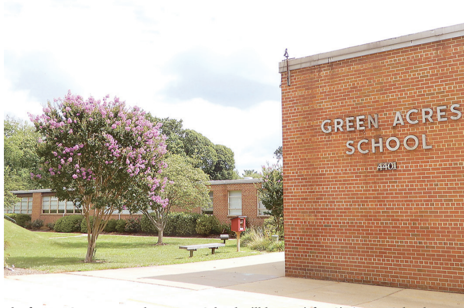
The former Green Acres Elementary School will host Fairfax City's new School Age Child Care program.

PROGRAM COST is estimated at $731,200 and is to be funded by $691,200 in child-care fees, plus $40,000 from CARES Act money. Expenses include building updates to WiFi and security; building repairs; program supplies; adding a portable bathroom; and purchasing PPE, plus first-aid and cleaning supplies. Lussier said community members could also donate, if they'd like.