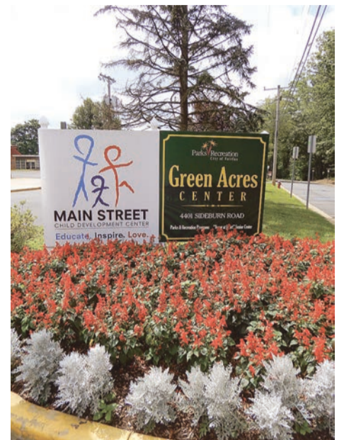
Main Street Child Development and School Age Child Care will both be in the Green Acres Community Center.