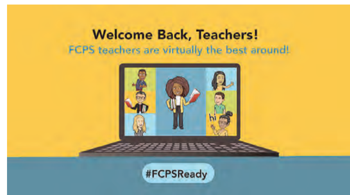
FAIRFAX COUNTY PUBLIC SCHOOLS