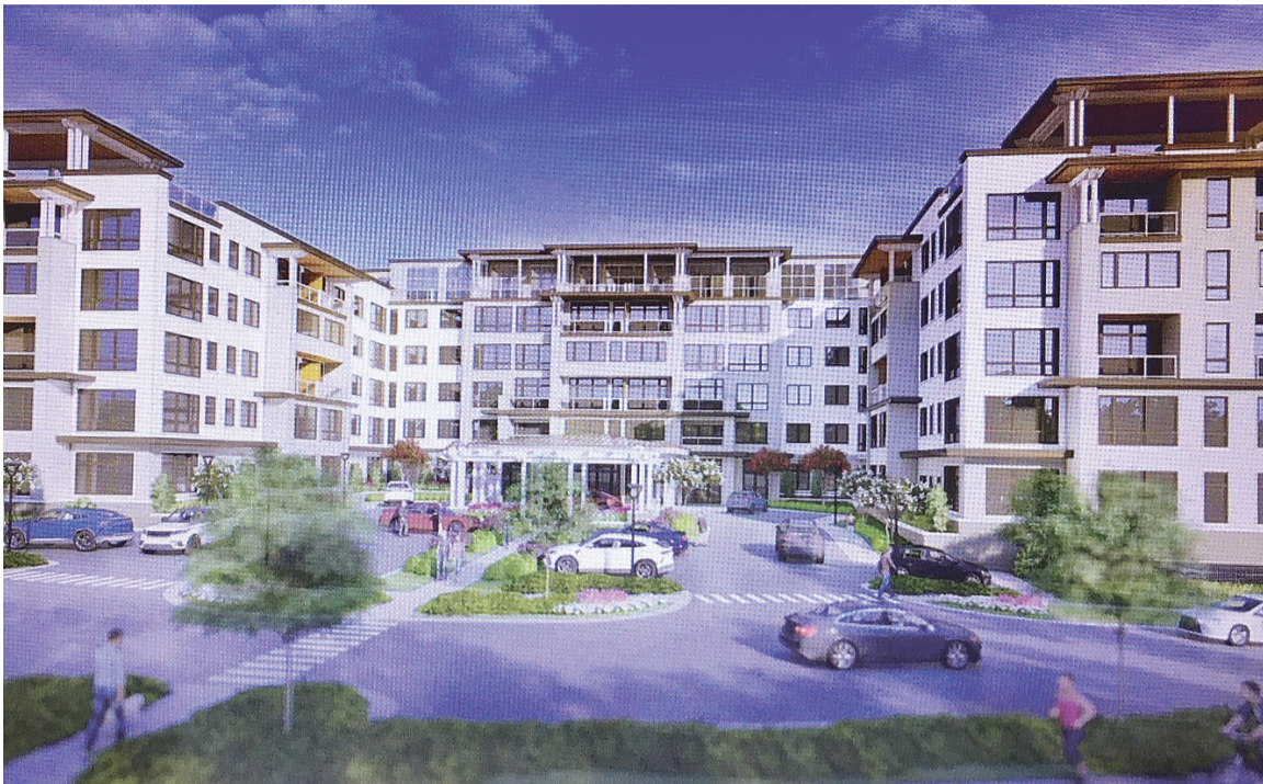
Artist's rendition of part of the Boulevards at Westfields in Chantilly.