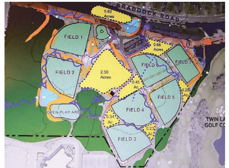
A map of the current uses at Braddock Park. The yellow areas are undeveloped.

All written comments must be received by close of business on Wednesday, December 9, 2020, to be included in the record of the public hearing.