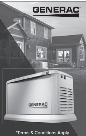
*Terms & Conditions Apply

Special Financing Available Subject to Credit Approval