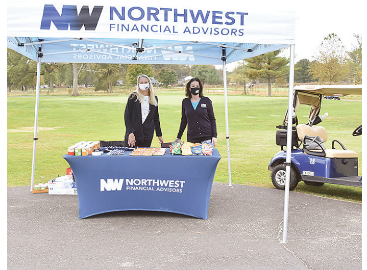
A refreshment table available to golfers courtesy of Bronze Sponsor Northwest Financial Advisors