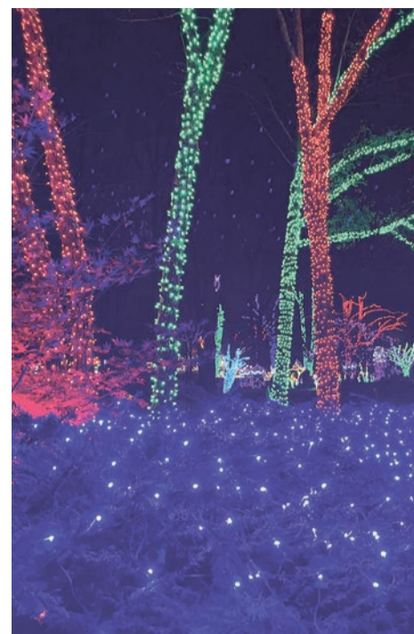
Meadowlark Gardens displays a sea of lights and colors to highlight elements of the natural world and brighten the holiday season.

All written comments must be received by close of business on Wednesday, December 9, 2020, to be included in the record of the public hearing.