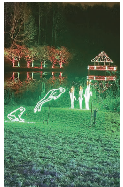
NOVA Parks helps visitors leap into the holiday season with colorful light displays.