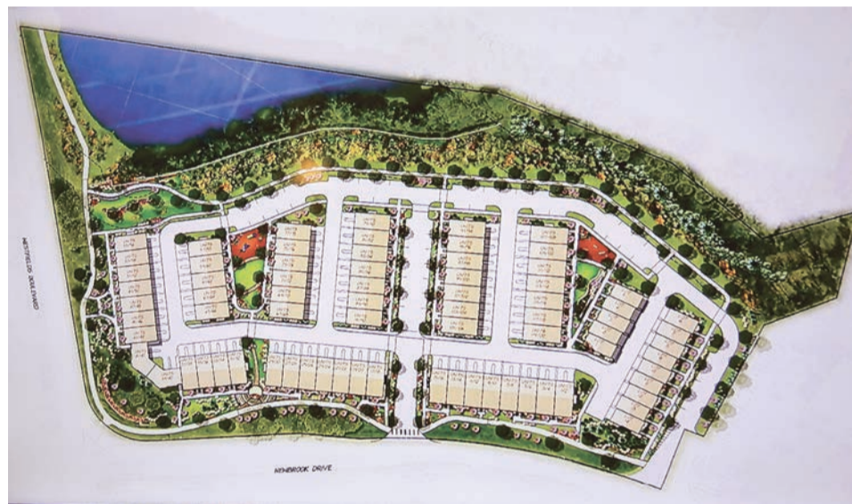
Site plan of the Stonebrook residential development in Chantilly.

Jet airplanes will fly 950 feet above the homes in Stonebrook, to be built directly underneath a Dulles Airport flightpath. Blue lines are arriving flights; red lines signify departures.