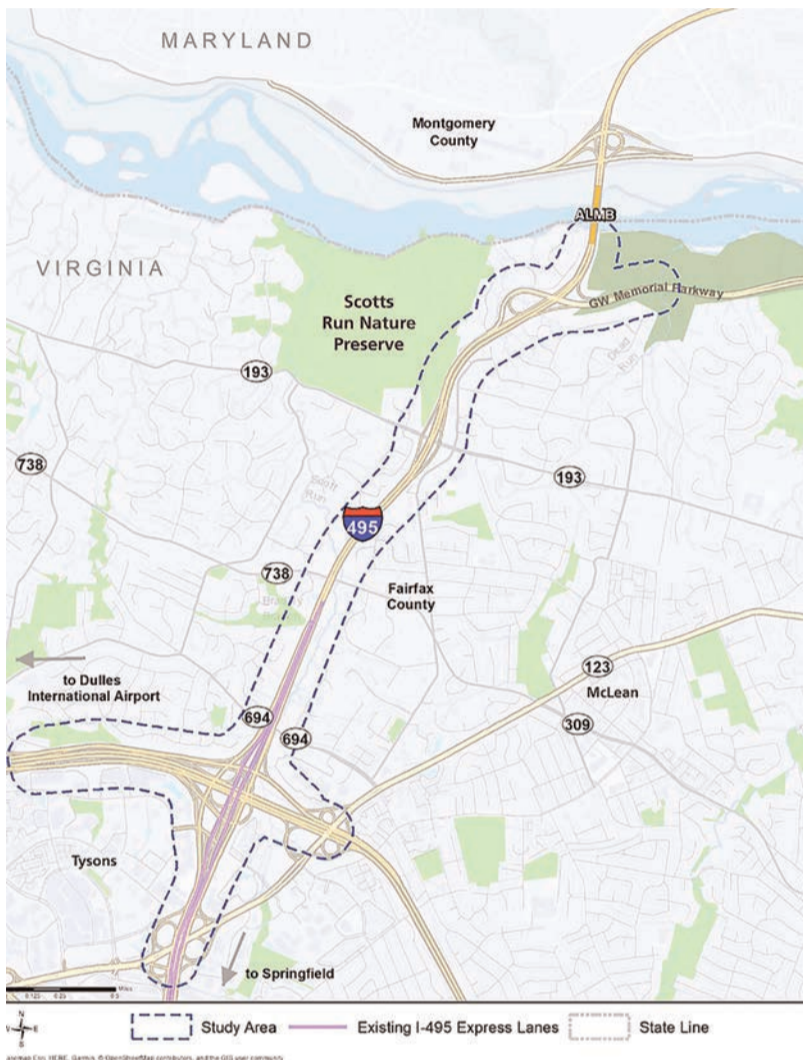
MAP BY THE VIRGINIA DEPARTMENT OF TRANSPORTATION The "495 NEXT" project limits.

Just when it seemed like the interstate network in Northern Virginia was completely outfitted with the toll lane options, transportation officials have etched out another project to stretch the 495 Express Lanes to the American Legion Memorial Bridge on the northern side of the Capital Beltway.