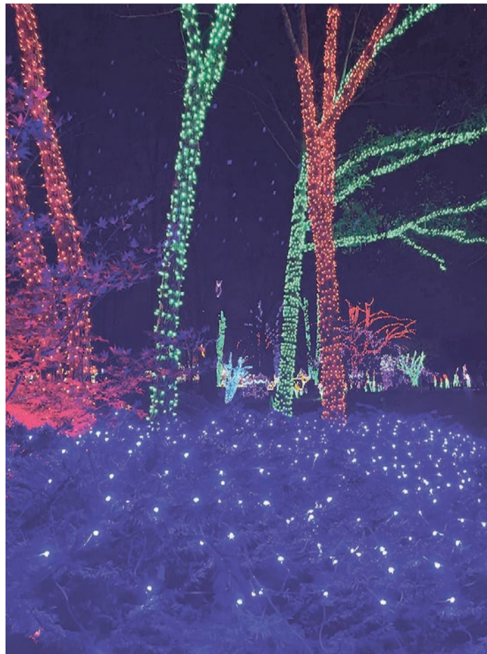
Meadowlark Gardens displays a sea of lights and colors to highlight elements of the natural world and brighten the holiday season.

Since the 1960s, people have been outlining private homes with lights. It became a family entertainment to drive around