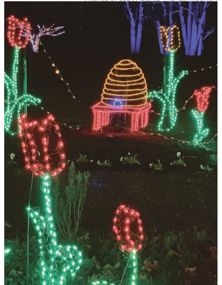
Bees of light visit flowers and hive, creating a recognizable buzz at Meadowlark Botanical Gardens.