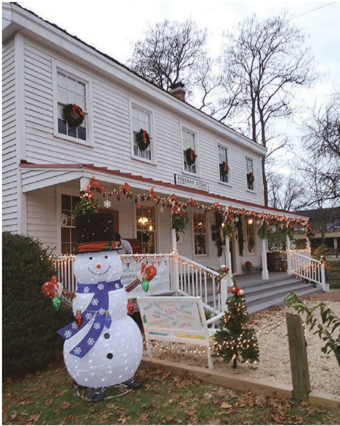
Members of Ayr Hill Garden Club and Historic Vienna, Inc. decorated the Freeman Store and Museum for the holidays.