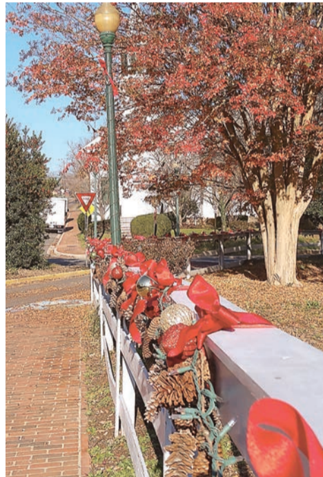
On Nov. 30, at 6:30 p.m., the Town will be streaming on Facebook and YouTube the lighting of the Town Holiday Tree and the Freeman Store and Museum.

To safely spark seasonal spirits, the Town of Vienna is bringing the annual Church Street Holiday Stroll right into homes via