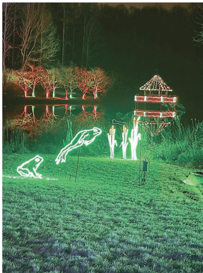
NOVA Parks helps visitors leap into the holiday season with colorful light displays.

between 8 and 10 p.m. to view the lights each season.