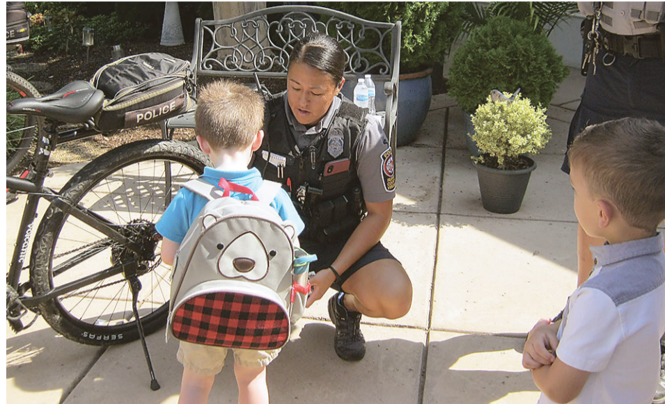
If an officer is on a bicycle, it makes it easier to approach some of the residents, particularly children.

There are certain events throughout the year that the neighborhood patrol units usually work, such as local parades or the National Night Out in the late summer. Those opportunities were limited this year due to the pandemic. The bike patrol teams often receive special assignments when concerns are raised by community members or at the direction of the commanders at each district station. For example, the Neighborhood Patrol Units were part of the arrest at Springfield Town Center in January 2019 when a suspect was videoing in the dressing room. A NPU was involved in another arrest when a fugitive escaped at Mount Vernon Hospital last winter, and they were involved in another residential burglary in 2018. Due to the