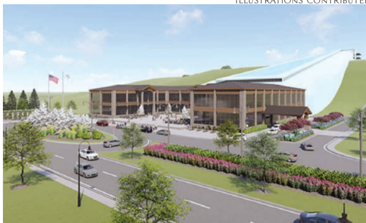
Another artist rendering of "Fairfax Peak."