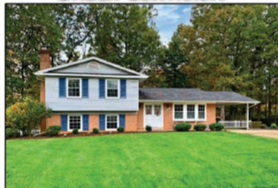
W. Springfield • $599,900