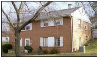
Alexandria - $400,000 Fixer-Upper

Jim Fox 703.503.1800 jim.fox@LNF.com Serving VA/DC since 1988 NVAR Lifetime Top Producer