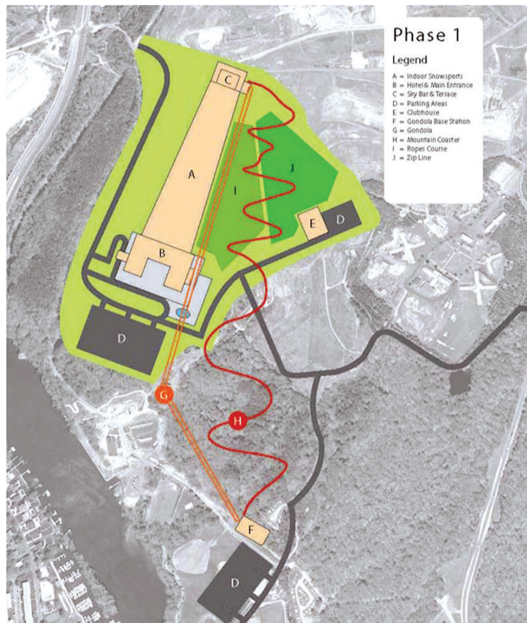
This is one plan for the facility.