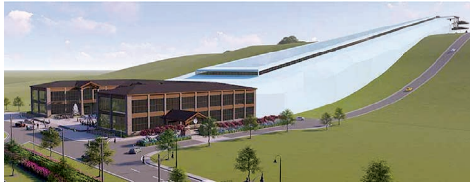
Artist rendering of the indoor ski slope.