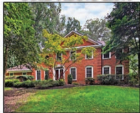
Fairfax Station • $920,000