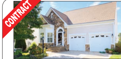
Gainesville Heritage Hunt 55+ $579,900

Pristine Top Flr Condo, 2 BR, 2BA, Gourmet Kit, SS Appls, Granite Cntrs. HDWDS. Fr/load W & D. Liv rm w Lg Walk-in closet-fits a desk to work from Home! Trex Porch. 1 pkg space. For this issue at the bottom of Slot 3 center justify the web address www.AmandaScott.net