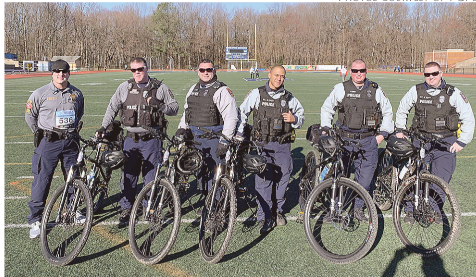
The outfits worn by a team are bulky for riding, but required for this line of work.

nature of this type of patrol, they were able to be present in a neighborhood where robberies were reported, and didn’t attract as much attention as a squad car may have.