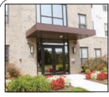
Fabulous Secure Condo in Over 55 Community $395,000 Spring Hill Gated Community Now vacant Ready for new owner!