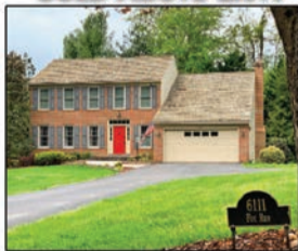
Fairfax • Fox Hunt • $740,000