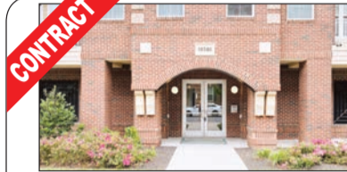
Herndon/Discovery Square $422,500

Pristine Top Flr Condo, 2 BR, 2BA, Gourmet Kit, SS Appls, Granite Cntrs. HDWDS. Fr/load W & D. Liv rm w Lg Walk-in closet-fits a desk to work from Home! Trex Porch. 1 pkg space. For this issue at the bottom of Slot 3 center justify the web address www.AmandaScott.net