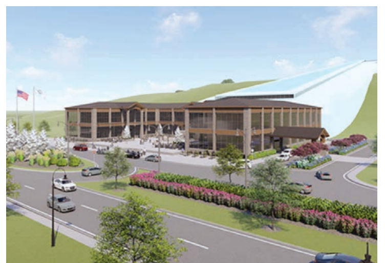
Another artist rendering of "Fairfax Peak."