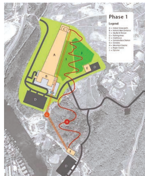
This is one plan for the facility.

"We hope you can provide answers to some of these concerns—especially those regarding energy use, environment, equity, and costs to the county—before the proj-