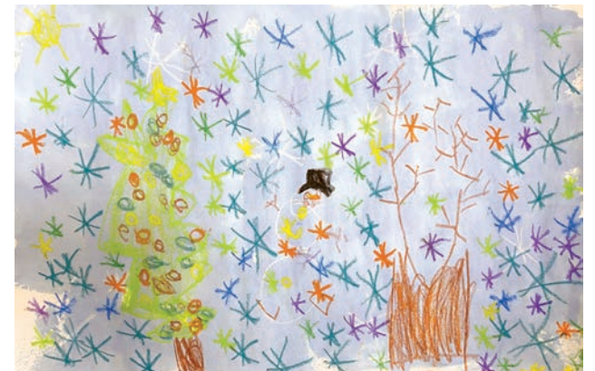
Isla Mazur, 4, Snow