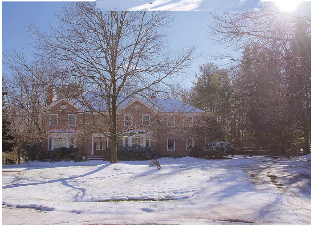
2 9204 Stapleford Hall Place — $1,450,000