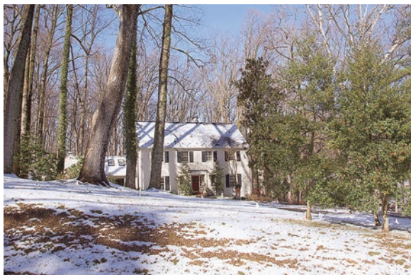
6 9745 The Corral Drive — $1,350,000

IN OCTOBER, 2020, 62 POTOMAC HOMES SOLD BETWEEN $430,000-$480,000.