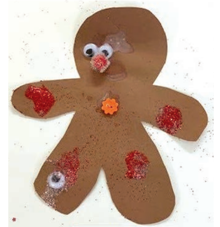
Thomas Kranias, 2. Gingerbread art.