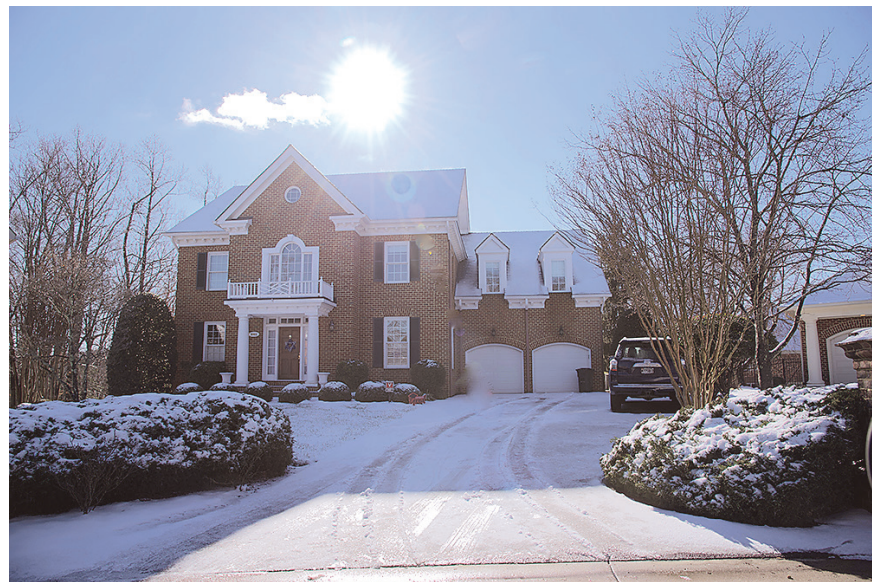
3 8901 Abbey Terrace — $1,425,000