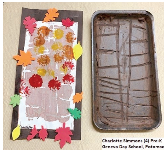
Charlotte Simmons (4) Pre-K Geneva Day School, Potomac