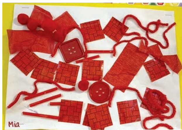
Mia Moise, 3, Red Day Art