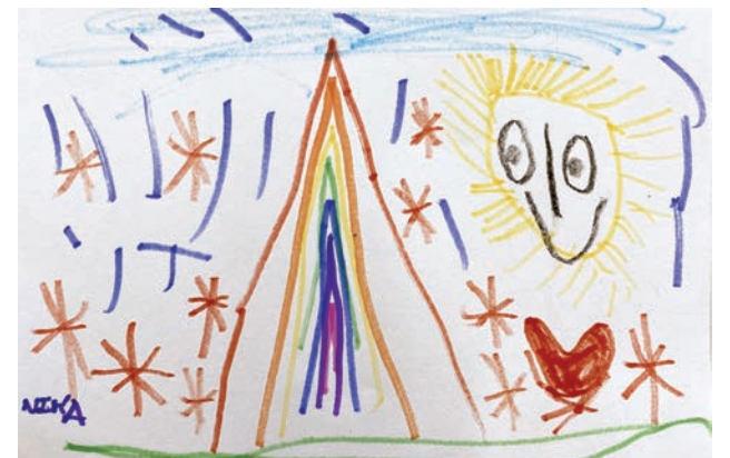
Veronica Pilchtchikov, 4