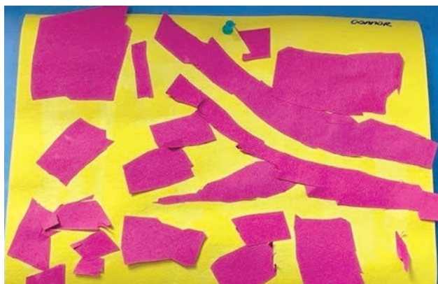
Connor Clayton, 4