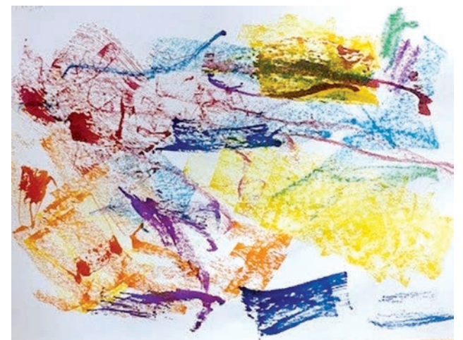
Luka Kauppi, 3, ice painting