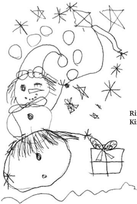
Rin Sato, 5, Kindergarten