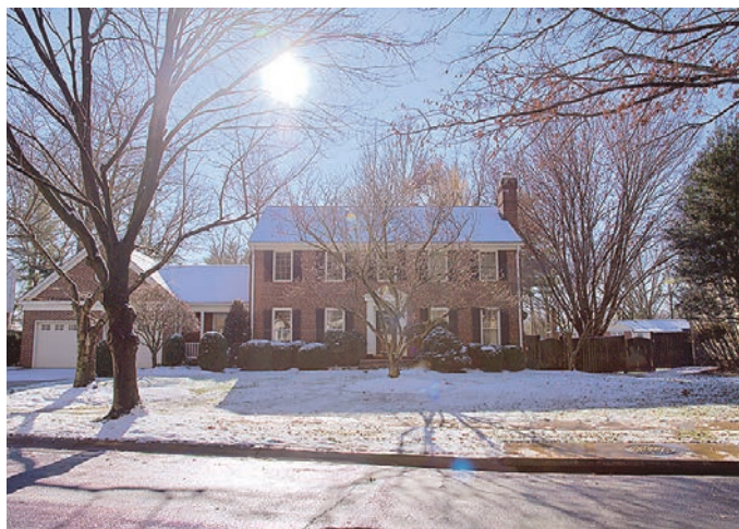
4 10608 Stable Lane — $1,425,000