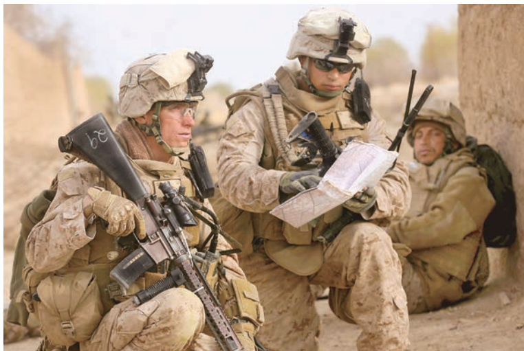
A local soldier was recognized for his actions by the military.

Here's a look at events in Mount Vernon from last year.