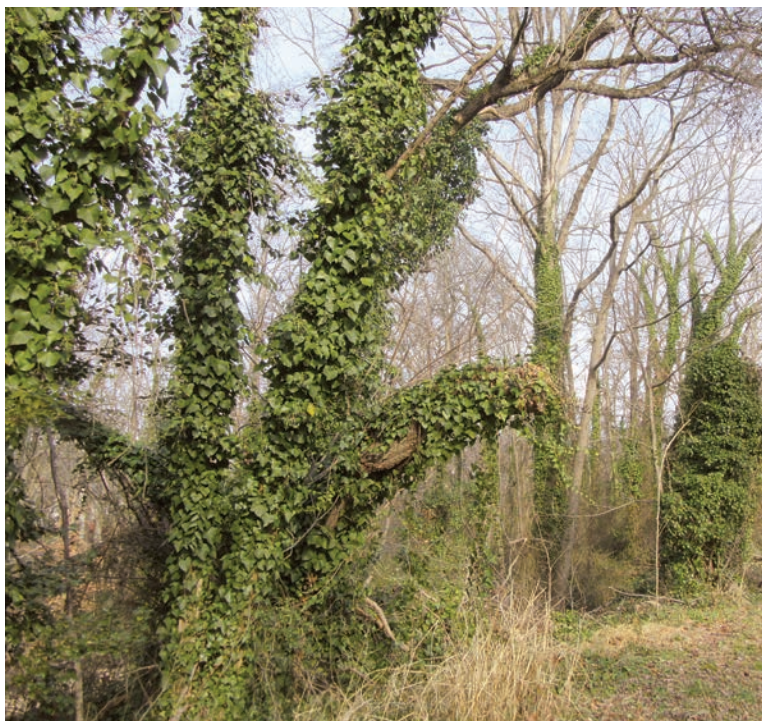
Ivy covers trees along Paul Spring Parkway in Hollin Hall and Paul Spring Stream Valley Park.

Invasive plants of the Mid-Atlantic: https://www.invasive.org/eastern/midatlantic/ .