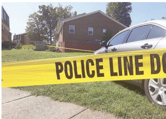
Further south in the Mount Vernon-Lorton area, a fatal shooting rattled a neighborhood.