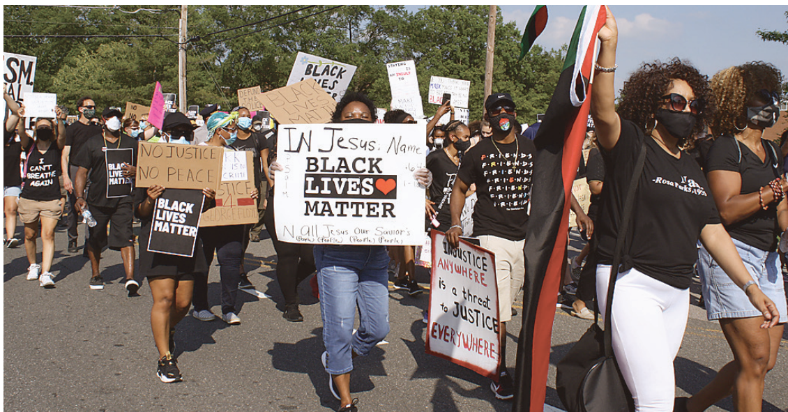
After police brutality claimed the life of George Floyd, a local Black Lives Matter march took place on Sherwood Hall Lane.