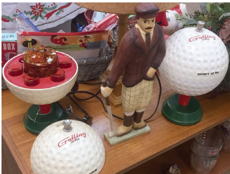
Sometimes knowing the history of an item increases its value at local gift stores.