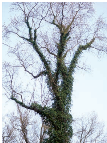
A tree in the Dyke Marsh Wildlife Preserve covered with ivy.

To help in Dyke Marsh, email info@fodm.org and put English ivy in the subject box. The Friends of Dyke Marsh will hold socially-distanced volunteer sessions from 10 a.m. to 12 noon on Jan. 9 and Jan. 18 and Feb. 6 and Feb. 20, 2021. Meet at the Haul Road trail entrance just off the parkway. Park in Belle Haven Park’s south parking lot. Wear a mask and gloves, long