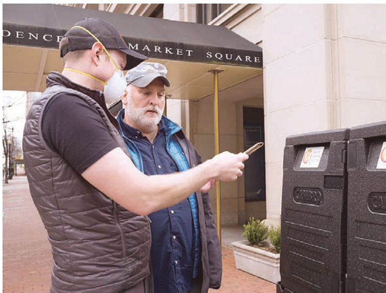
A weekly catfish feast took place at a location along Richmond Highway.