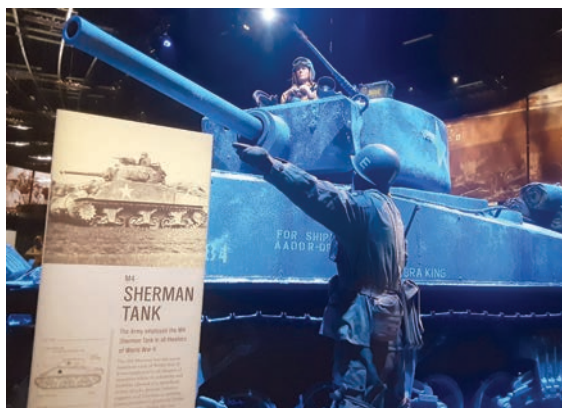
Army Museum opens on Veteran's Day at Fort Belvoir.