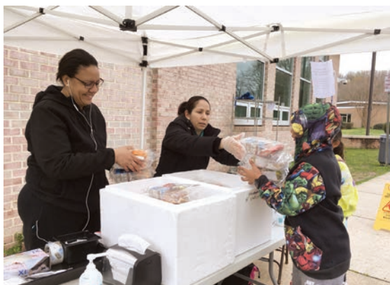
After schools were closed, the FCPS used them for food distribution as the pandemic ramped up early in the spring.