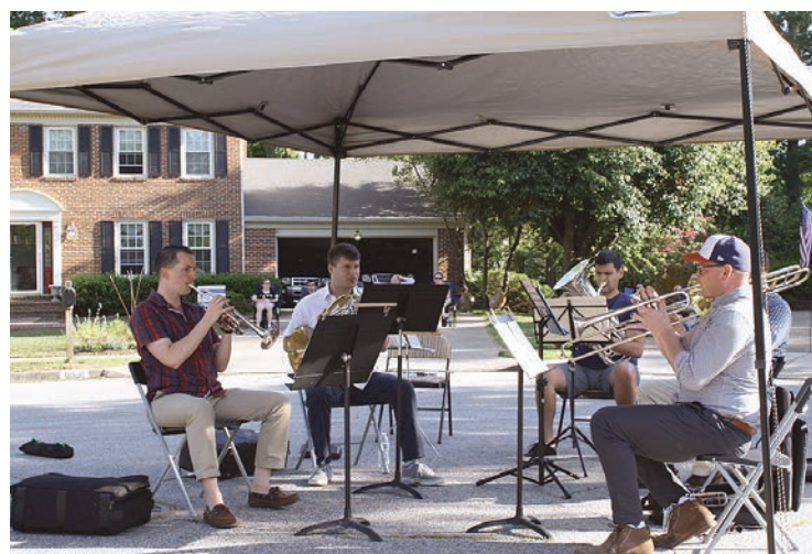
Socially-distanced concerts were held by local musicians in a Mount Vernon neighborhood.