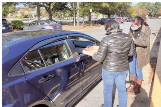
The election in November had special features due to the pandemic, like ballots filled out from the driver's seat.