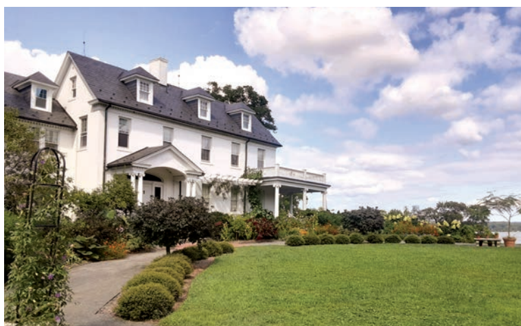
The American Horticultural Society announced its intention to raise cash by selling River Farm. Officials and community members have been working to stop that since. The future remains uncertain.