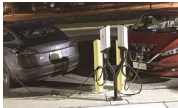
The electric-vehicle charging station outside Fairfax City Hall.