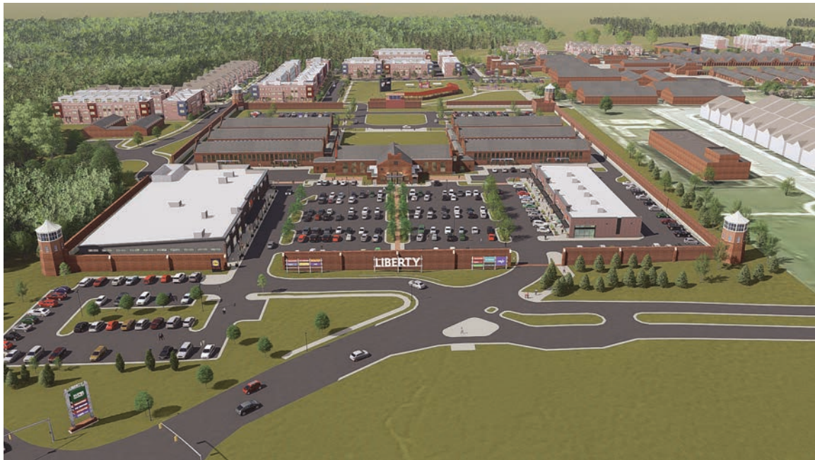
In an artist rendering, the corners of Liberty Market are the old watchtowers from the prison.