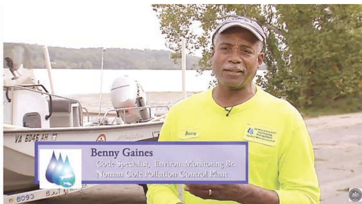
Fairfax County Wastewater Management

“Having Mid-Atlantic APWA recognize the work of DPWES and our partners with these awards acknowledges the excellence in the building and