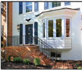
Rhygate • $590,000