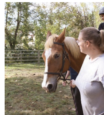
At past "Clifton Day," festivities, NVTRP provided rides to children in a small arena.

In order to meet the growing demand for NVTRP services, and provide an enhanced experience for current riders, their families, and volunteers, they are conducting a whole scale capital improvement project that will unleash property's full potential. Phase I, including the new, lit outdoor Trefry Riding Arena, expanded parking, acces-