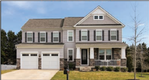
Manassas • Estates at Bradley Square • $774,900