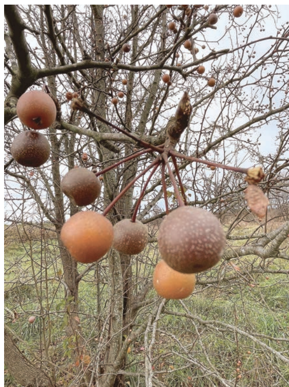
Callery pear and its cultivar, Bradford Pear, escape area yards and grow in dense groupings in nearby forests, crowding out native trees

nature by the Governor Northam. If enacted by the Governor the work study recommendations will be due in November 2021 for potential action by the 2022 General Assembly.