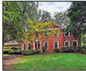
Fairfax Station • $920,000