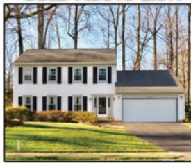
Burke • $710,500