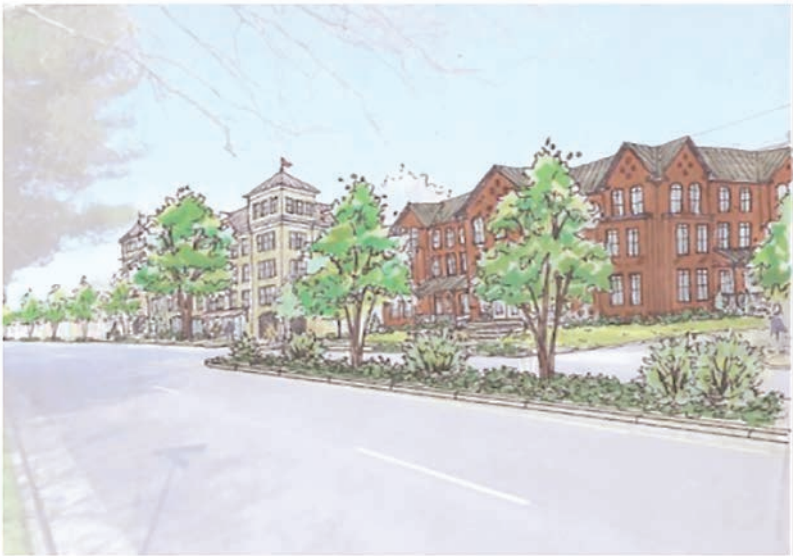
Conceptual Rendering of General Zone along Chain Bridge Road A concept design for an area along Chain Bridge Road.