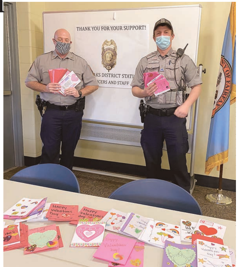
Fair Oaks Police