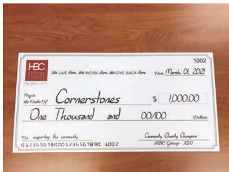
HBC Group Check donated