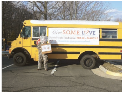
Donated items were loaded onto a Langley school bus.

For the past three weeks, Langley's students, parents, and faculty/staff have participated in the "Give S.O.M.E. Love" food drive benefiting So Others Might Eat (S.O.M.E.), a Washington, DC-based service organization that supports those experiencing homelessness and poverty. Together, the Langley