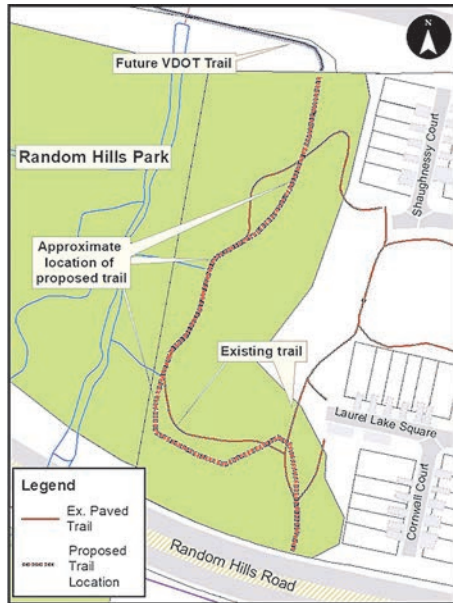
Some 1,000 feet of asphalt trail within Random Hills Park will be upgraded.

Construction access will be from Random Hills Road and Route 50. The trail will be built entirely on Park Authority property and will extend through the park on the eastern side of Difficult Run. It'll be designed and constructed to ADA standards, so it'll serve both pedestrians and cyclists of all abilities.