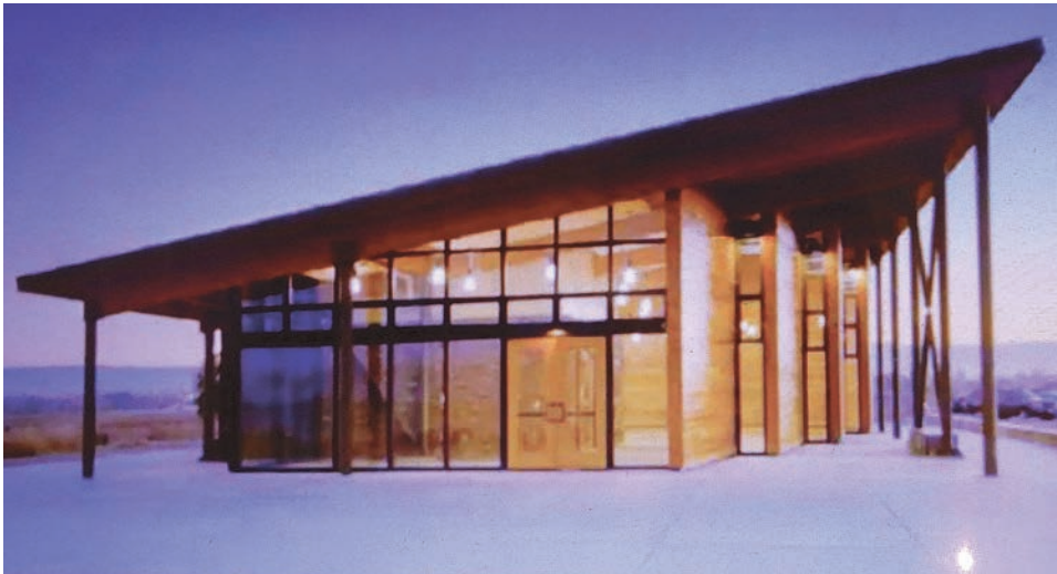
The energy-efficient building will be constructed of reclaimed wood to reduce its carbon footprint.