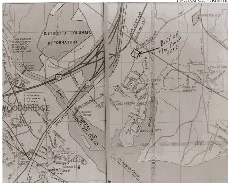
A map showing the location where the body was found in 1972.