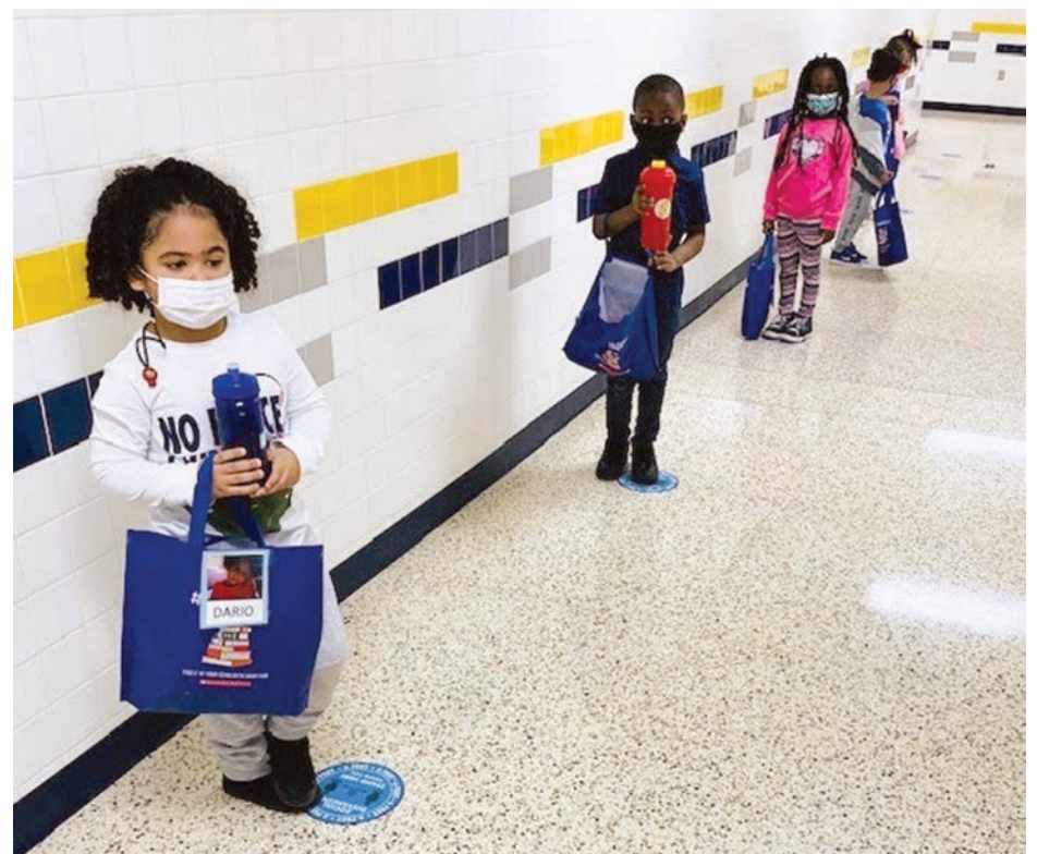
Pre-K students have been doing a great job social distancing and wearing their masks.

We have been accepting requests from families to change their students from