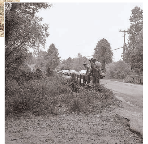
Fairfax County Police officers investigating the site where the body was found.