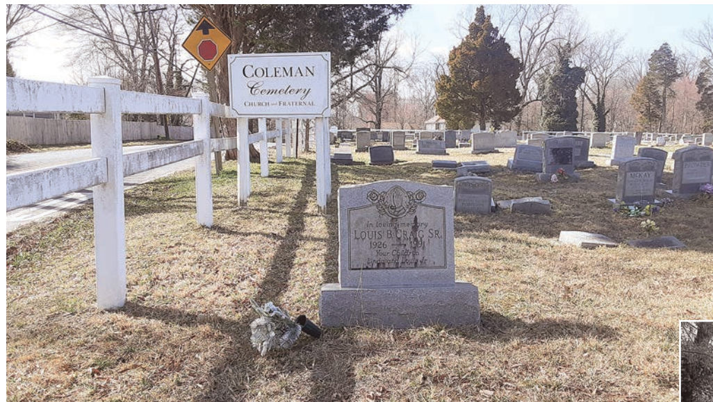
In this Mount Vernon neighborhood cemetery, the exact location of the youth's grave is now unknown. Several gravestones in the cemetery are crooked and falling down, particularly in the back.

When the cold case was posted on the FCPD social media page, the responses poured in. "Beyond sad for this precious little one. Prayers that the case is solved. He needs justice and an identity," wrote one woman. "This is an absolutely horrible story," added another. "Happy that he was buried and given a name, but sad that his true identity has never been found and the person(s) responsible haven't been found ei-