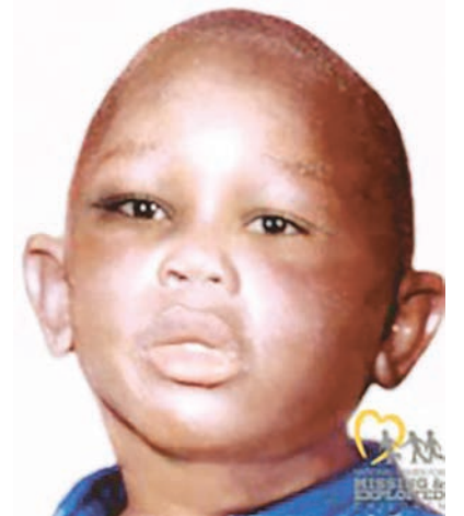
The young boy has never been identified.