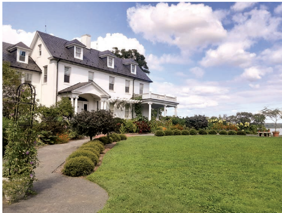
River Farm on the Potomac River.