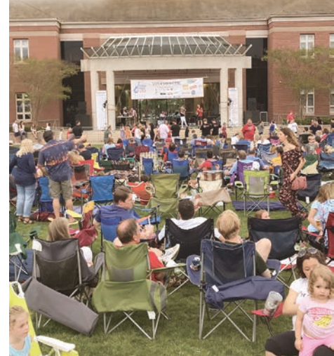
Friday Night Live! May 4, 2018, produced by the Herndon Chamber of Commerce (File photo)

"We cannot hold Friday Night Live! without the incredible support we have received