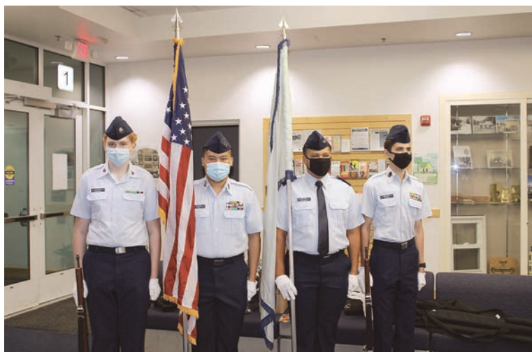
Burke Composite Squadron’s Color Guard.

The Civil Air Patrol’s Virginia Wing recognized the Burke Composite Squadron with the 2020 Squadron of Merit Award in March. Each year, the Wing evaluates the actions and activities of the 22 Virginia Civil Air Patrol squadrons across the state and selects the top squadron for this special recognition. Burke Composite Squadron members have collectively and individually continued with and expanded unit activities during the past year, despite the pandemic. While meeting virtually, the squadron hosted the President of the Space Force Association and the Astrobotics Mission Director for the Peregrine Lander lunar mission. As part of the Peregrine Lander mission, the squadron advanced a special project with a small payload containing the names of Civil Air Patrol members and Air Force Association StellarXplorer’s competitors as well as the Civil Air Patrol patch design on