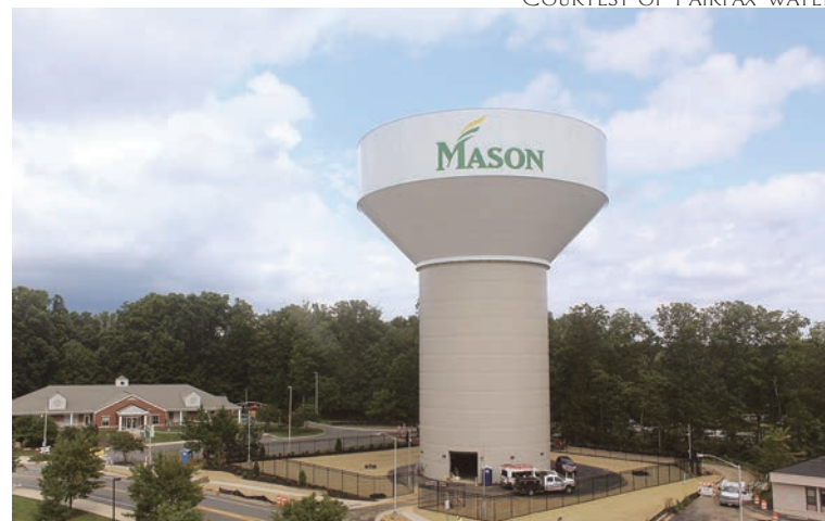
New water tank is on GMU property.

approximately 800 feet of 30-inch and 42-inch diameter water main, installation of new water flow meters, and interior pump station improvements. Construction limits