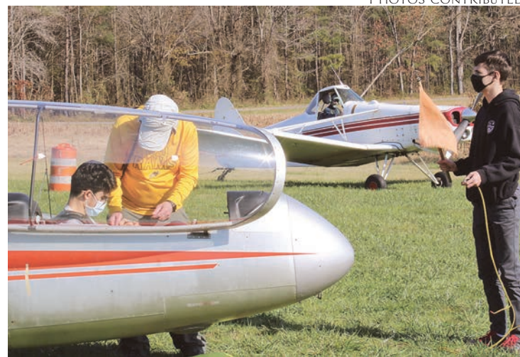
Glider orientation flight.