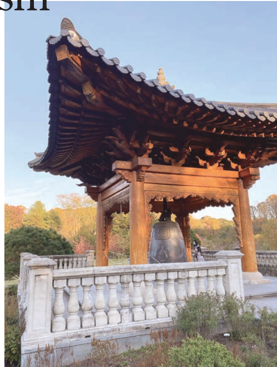
Bell of Peace & Harmony, Meadowlark Botanical Gardens, installed in 2011 to commemorate the equality, opportunity, and freedom Koreans once found in the United States