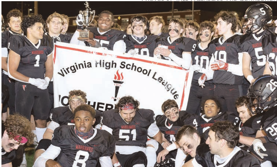
The Madison Warhawks win the VHSL Region 6D Championship and will face South County in the VHSL State Semifinals.