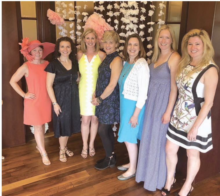
The 2019 Spring Tea.

Discovery Sampler. 1 p.m. and 2:30 p.m. at Hidden Pond Nature