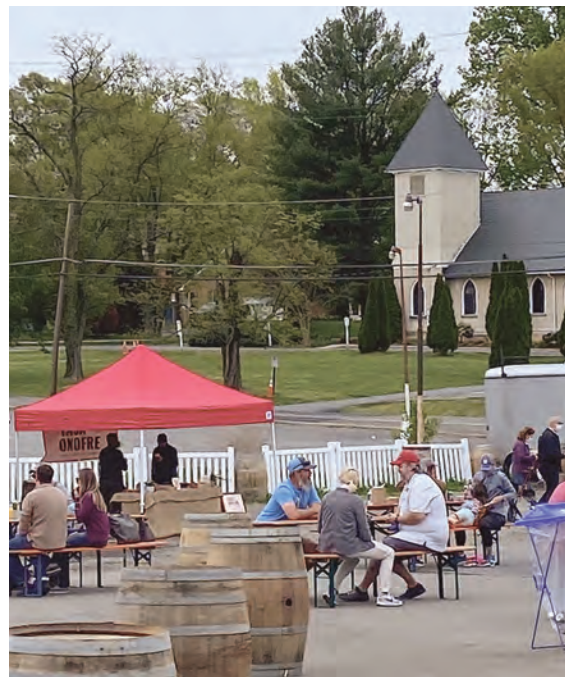
Families honor Mother Earth at the one-day Clean Fairfax event to promote sustainability in a fun and interactive environment, enjoying vendors, workshops, and opportunities to learn at Earth Daze; a Clean Fairfax and Aslin Beer Company Celebration in Herndon.