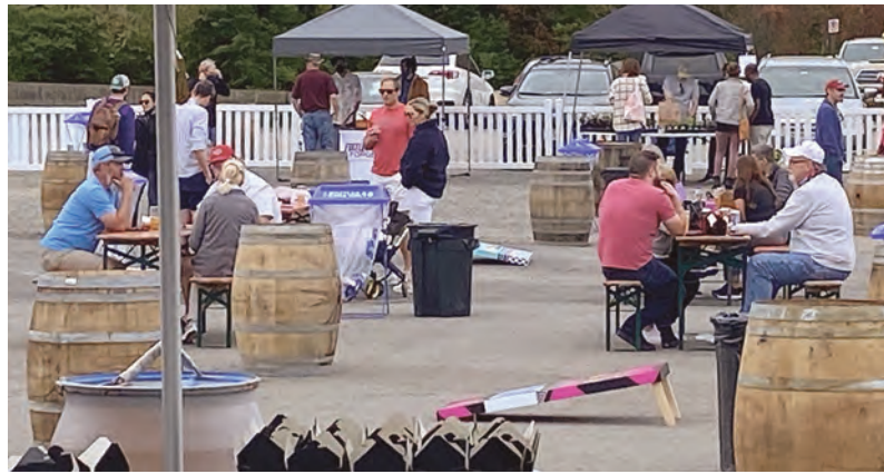
Earth Daze 2021, presented by Clean Fairfax and Aslin Beer Company, Herndon location.