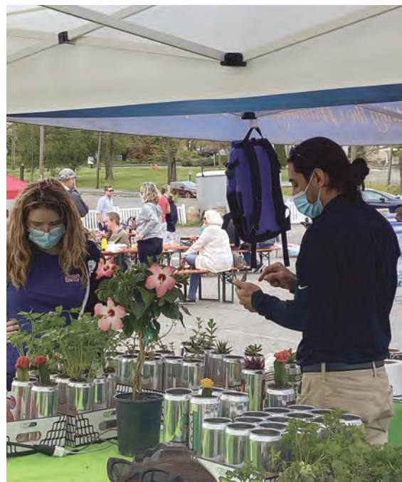
A shopper pauses at a vendor table during the Clean Fairfax and Aslin Beer Company Celebration of the 51st Anniversary of Earth Day.