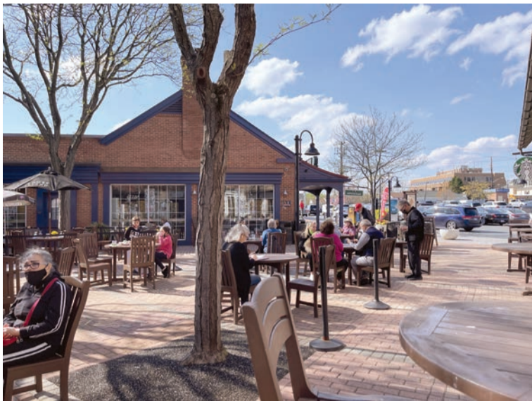
The courtyard in Potomac Place Shopping Center, next to Starbucks, is a popular gathering spot as the weather gets warmer. There is also space for outdoor dining for Renato and Lock 72 restaurants as well.