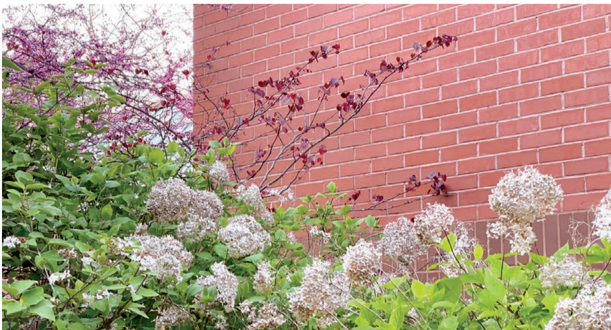
The Potomac Library is available for telephone service and Holds to Go! contactless holds pick-up service only. The bookdrop is open. But the plantings and blooming trees around the building brighten the view. https://montgomerycountymd.gov/library/services/holds-to-go.html

For listing of virtual events, see https://mcpl.libnet.info/events?l=virtual+branch&r=thisweek