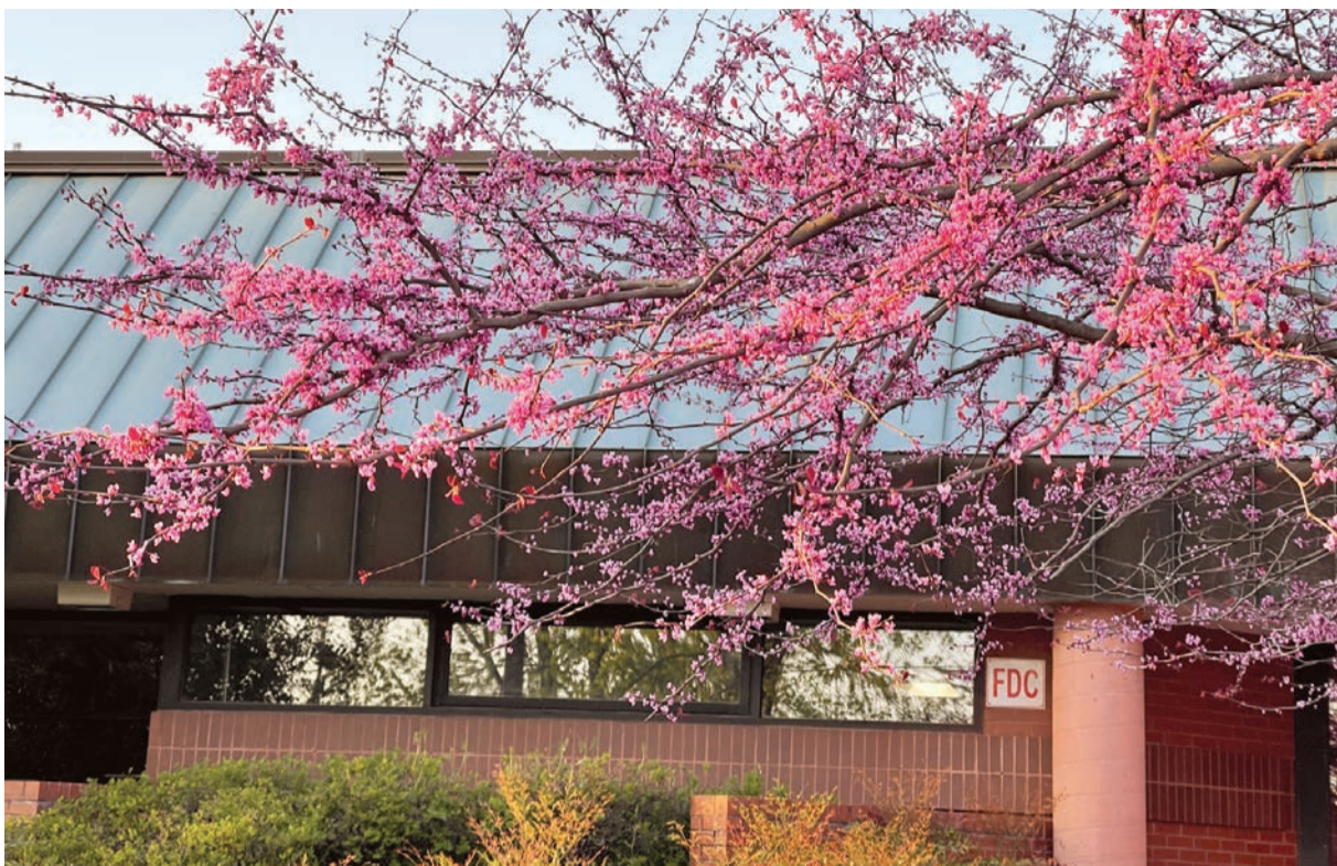
While the Potomac Village Garden Club recently worked with Glenstone Museum to create a garden of native plants in front of Potomac Library along Falls Road, the club has been maintaining flowers and gardens around the library since its inception. Native Redbud trees have been blooming on all sides. For listing of virtual events, see https://mcpl.libnet.info/events?l=virtual+branch&r=thisweek