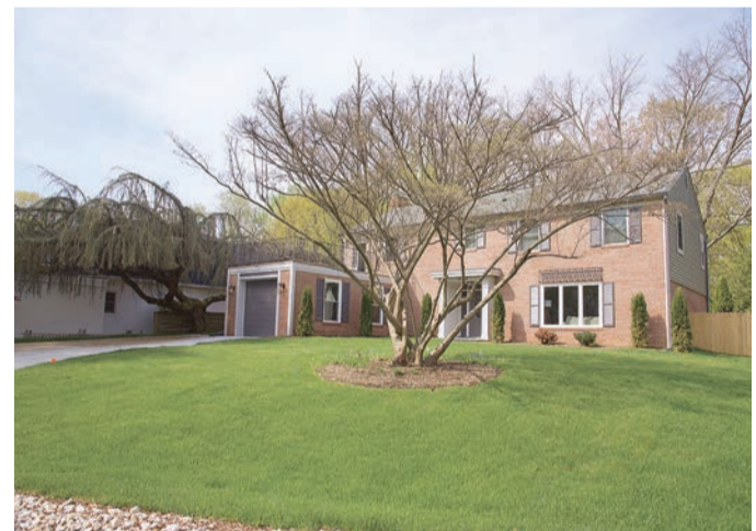
5 10534 Tyler Terrace — $1,153,900