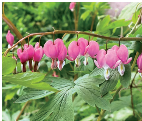
More Potomac flowers of the spring. Azalea, redbud, late blooming daffodil, bleeding heart and wisteria.