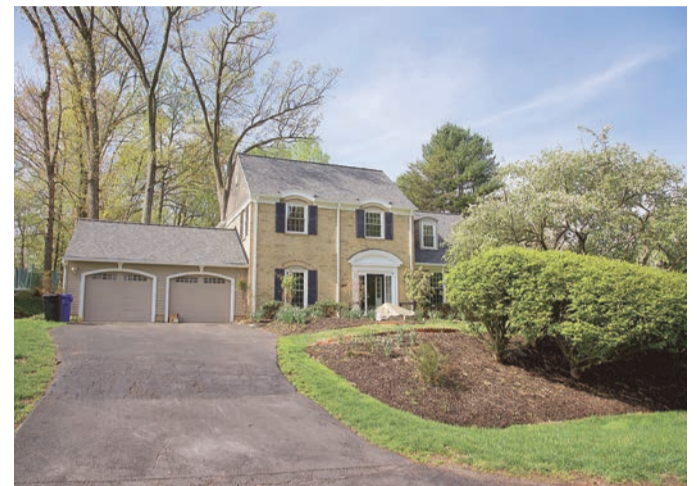
6 9328 Chesley Road — $1,125,000