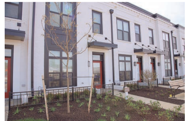
8 11326 Emerald Park Road — $1,067,410