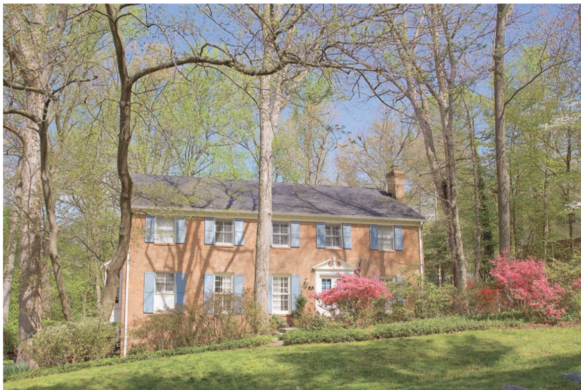
2 11904 Ledgerock Court — $1,190,000

IN FEBRUARY, 2021, 48 POTOMAC HOMES SOLD BETWEEN $2,599,000-$305,000.