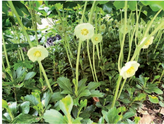
Mayapples are plants that grow in the woods, and groups like this sometimes share a single root. While they might flower in May, the fruit will ripen late in the summer.