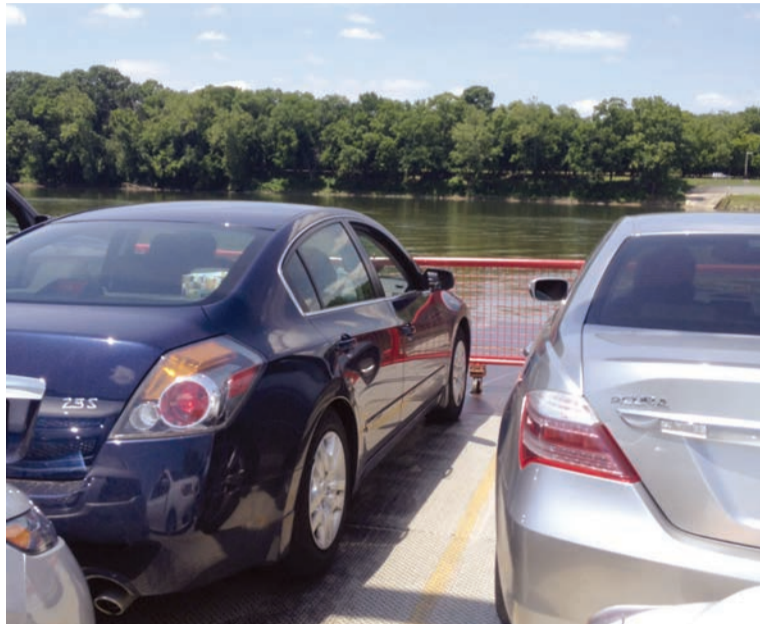
Whites Ferry carried 600-800 vehicles a day between Montgomery and Loudoun counties before its sudden closure at the end of 2020. Efforts are underway to get the ferry operating again.