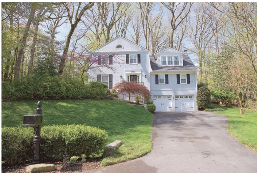
3 11904 Tallwood Court — $1,185,000