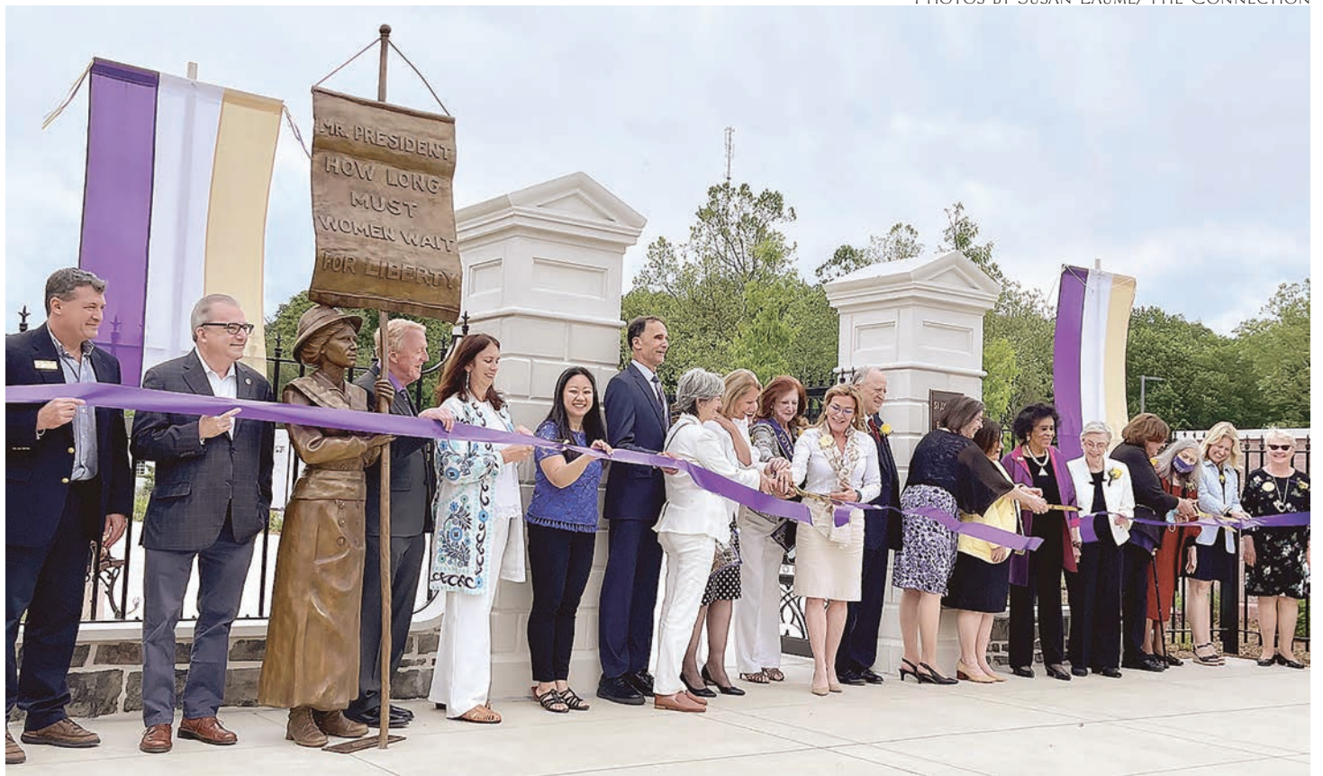
Association members, NOVA Parks Board members, State legislators, and County Supervisor cut the Turning Point Suffragist Memorial ribbon in front of the entrance replicating the White House gates where suffragists maintained their "silent sentinel."