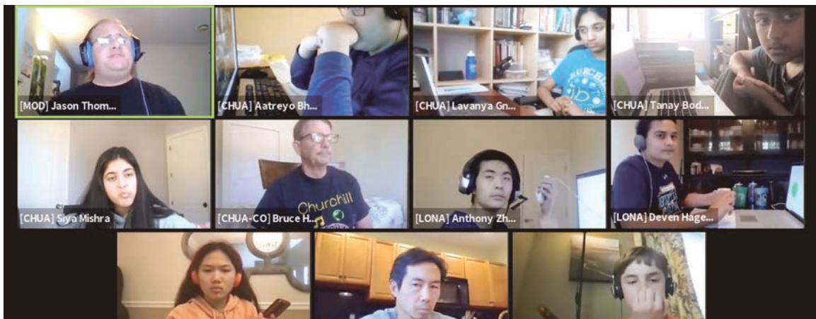
Longfellow Middle School sent two teams to the 2021 Championship.

For more information on the American Association of University Women and the McLean Area Branch, visit the AAUW McLean Area website at http://mclean-va.aauw.net .