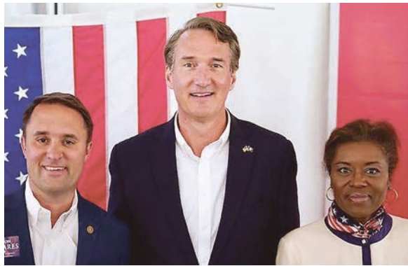
The Republican stateside ticket, from left: Jason Miyares for attorney general, Glenn Youngkin for governor and Winsome Sears for lieutenant governor.