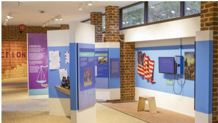
Visit the "Revolutionary Rights" exhibit at Gunston Hall while visiting the home of this Founding Father.

On July 2, noon- 1 p.m., join a Virtual Gallery Talk with The Chief