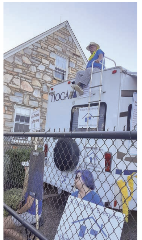
One of the Allies with a yellow lei, needed a better view.

"Co-locating services at the site and providing supportive housing in a new, modern facility aligns with county strategies to prevent and end homelessness in the Fairfax-Falls Church community," the advisory committee said on the Fairfax County website.