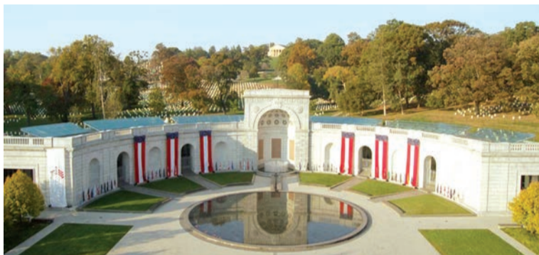
The Military Women's Memorial in Arlington is a great place to see the DC fireworks while missing the crowds.