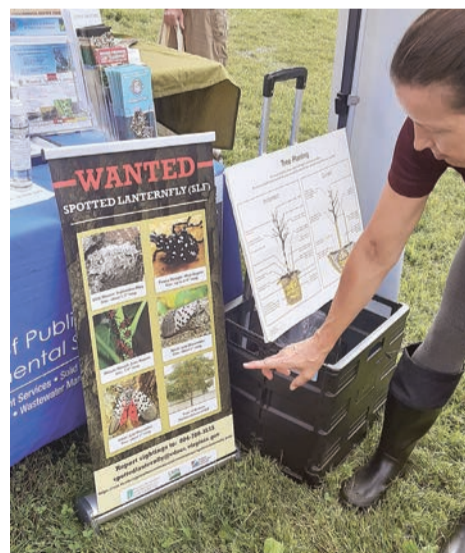
Education about the spotted lanternfly was part of the environmental expo. The invasive spotted lanternfly could seriously damage grapes, peaches, hops and other crops in Virginia where it was first detected in Frederick County, Va. in January 2018.