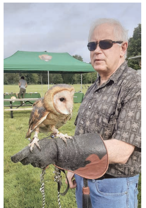
Barn owls like barns, silos and open space, not development.