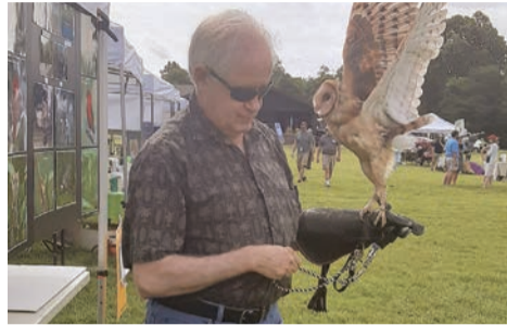
Phantom the Barn Owl squawks and flaps her wings, welcoming people to the Environmental Expo at Fort Hunt Park.