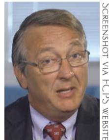
SCREENSHOT VIA FCPS WEBSITE