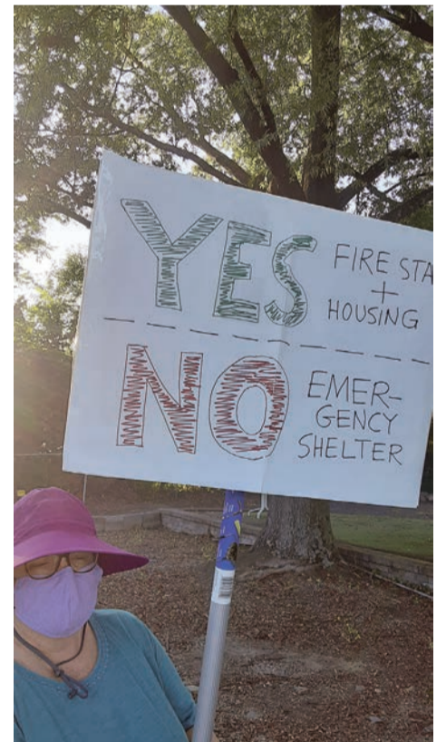
A split decision?

the shelter, fire station and housing included nine places along Richmond Highway, some of which were "not for sale," or "not available," and one in Lorton was an "undesired location due to proximity to Elementary School."