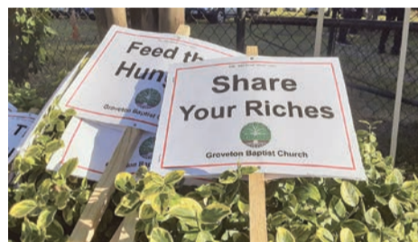
Another sign to share the wealth from Kennedy Center Shelter Allies.

values. The response from the officials cited evidence that was "inconclusive," they said. This was reiterated a few times.