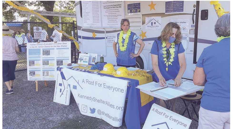
The Kennedy Shelter Allies had an RV, literature and leis, but none lived within 1,000 feet of the proposed shelter.