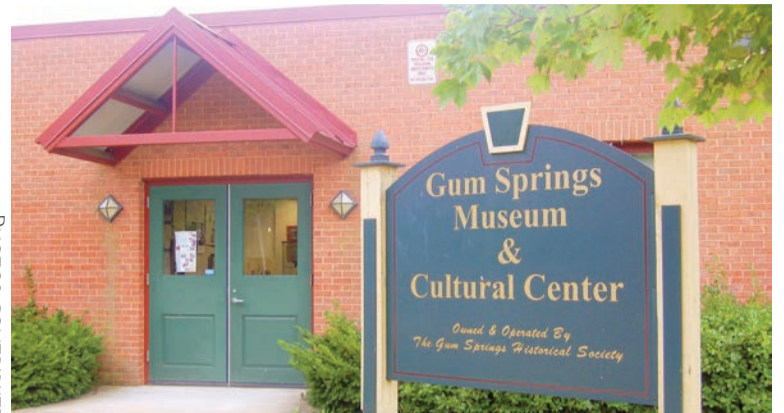
Gum Springs Black History Museum now has a virtual tour you can find on their website.

Avoid the crowds this July 4th by viewing D.C.'s spectacular fireworks display at a comfortable, exclusive event at the Military Women's Memorial. Enjoy a delicious catered buffet, beer and wine, live music, and family-friendly activities for all ages. Your all-inclusive