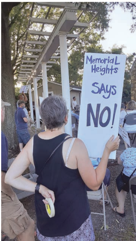
Signs, signs, everywhere, signs.