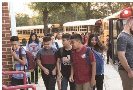
The first day of school for 2021-22 for Fairfax County Public Schools is Aug. 23.

Each FCPS elementary school has school supply lists posted to their school's website. Middle and High schools often supply these lists on their websites or provide them to students on their return to school, according to FCPS. Costs to purchase school supply items as viewed on the individual FCPS websites can run upwards of over $100 per student with individual teachers, especially at the higher grades requesting additional supplies, such as a TI-83 series graphing cal-