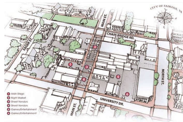
Asian Festival map.

— FCPS OFFICE OF COMMUNICATION AND COMMUNITY RELATIONS