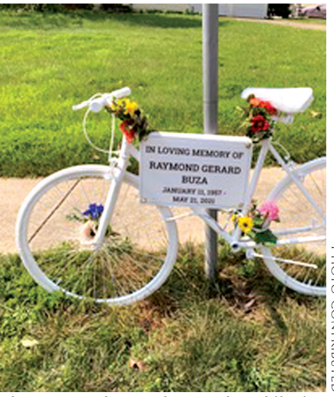
The Raymond Gerard Buza ghost bike is a reminder to all that pass the site to be wary of bicyclists.