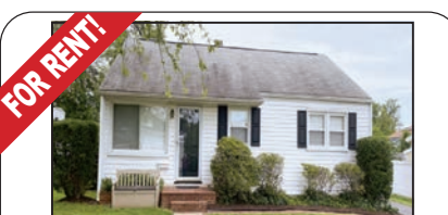
Falls Church $2,495 per month

*Terrific Pimmit Hills location * 3 bedrms * 1 bath * Family rm addition * Fresh paint & new carpet * Flat fenced back yard with 2 sheds * Long driveway for off street parking * Short walk to Metro bus * Convenient to shopping, commuter routes, Tysons, DC * No smokers or pets please.