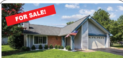
SPRINGFIELD SWIMMING POOL! $649,900

Enjoy an active lifestyle at South County's premier 55+ Adult Community. Largest floor plan with 2 bedrooms, 2 baths plus a sun room. Tall ceilings, hardwood floors, fireplace, new HVAC system! $20K dedded garage & 2nd parking space plus a $6,000 storage room.