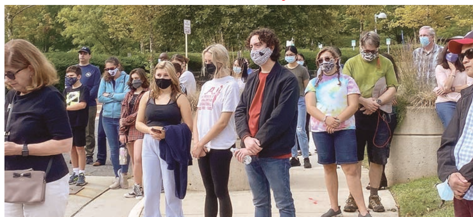
Volunteers and community members gather for the 20th anniversary remembrance of 9/11 and the kickoff of Volunteer Fairfax's 26th annual VolunteerFest featuring more than 30 projects.