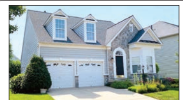
Gainesville $659,900 Heritage Hunt 55+ Stone-front 3 LVL Patuxant, 2 BR, Den, Loft, 4 BA, Grmt Kit, Grantie, SS appls, HDWDS, Liv, Din, Brkfst, Gas Fpl, Fin LL: Rec rm, Gsmes rm, Den, Storage rm, Trec Deck, 2 car Gar.