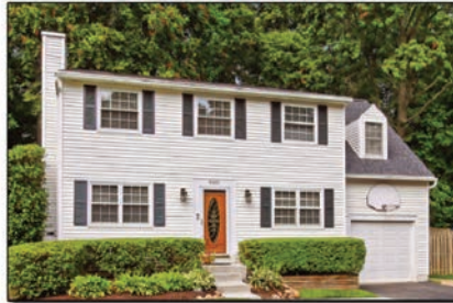
Springfield • Newington Forest • $649,900

Sellers Market Is Still Going Strong! Call John Today For A Free Home Evaluation!