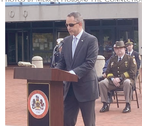
Don Graves, deputy secretary, U.S. Department of Commerce