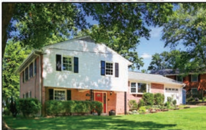
West Springfield • $700,00