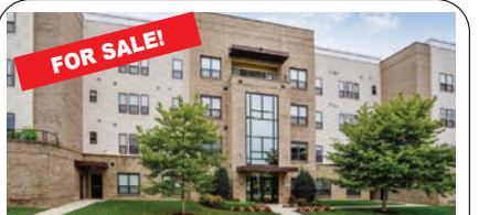
SPRING HILL FABULOUS AMENITIES! $449,900

Enjoy an active lifestyle at South County's premier 55+ Adult Community. Largest floor plan with 2 bedrooms, 2 baths plus a sun room. Tall ceilings, hardwood floors, fireplace, new HVAC system! $20K dedded garage & 2nd parking space plus a $6,000 storage room.