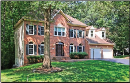
Manassas • Riverview Estates • $784,900