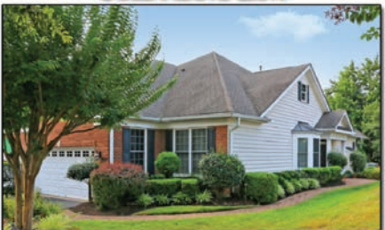
Haymarket • Regency at Dominion Valley • $570,000