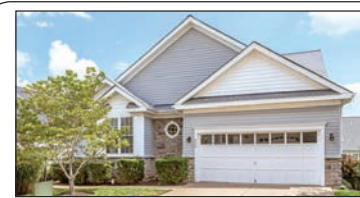
Gainesville $670,000 Heritage Hunt 55+ Stone-front 3 LVL Marjoram, 3 BR, 3.5 BA, Grmt Kit, Grmt cntrs, SS appls. HDWDS, Brkfst, Liv, Din, Sunrm, P Shtrs, Gas Fpl, 2 m/W BRs, Loft, Fin LL - Rec rm, Office, storage, potential in-law suite, 2 car Gar, Lndscpd Yd, Irrig syst.