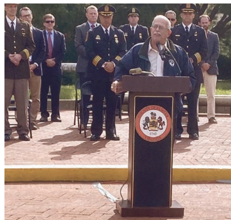
U.S. Rep. Gerry Connolly