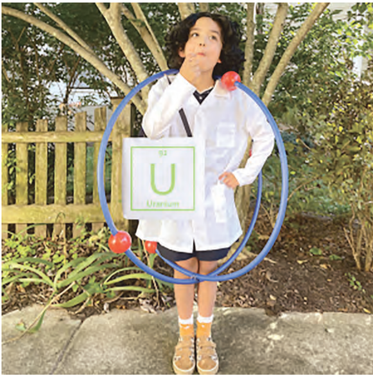
Chien-Shiung Wu Costume.