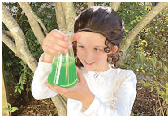
Marie Curie Costume

Rosie Riveters is a nonprofit whose mission is to equip and empower girls from diverse backgrounds to be strong, confident, and competent in STEM. Founded in 2015 in Arlington, Va., Rosie Riveters has served more than 4,000 girls across Arlington and Fairfax counties via interactive STEM programs, the majority of which are offered to participants completely free. Since the start of the COVID-19 pandemic, the organization has distributed 2,300 STEM kits to keep children at Title 1 elementary schools and community centers engaged in STEM. www.RosieRiveters.com .