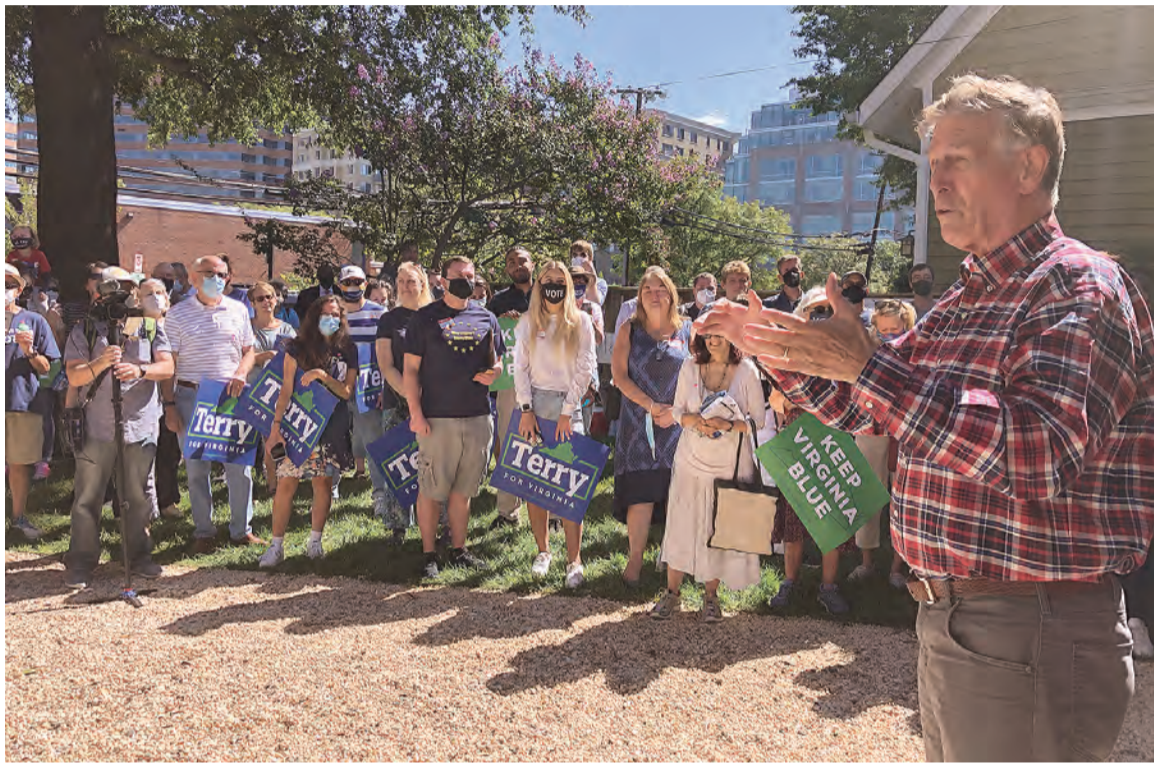
U.S. Rep. Don Beyer introduces U.S. Sen. Amy Klobuchar to the crowd of “get out the vote” activists in Clarendon.