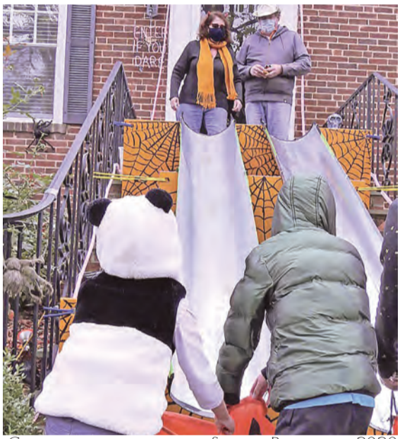
CONNECTION FILE PHOTO BY SHIRLEY RUHE FROM 2020

Like Morgan's daughter, there are young children