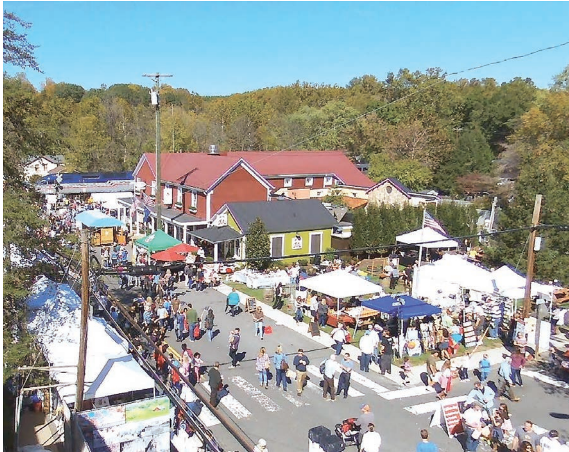
Clifton Day will take place Sunday, Oct. 10, 2021 in the Town of Clifton.