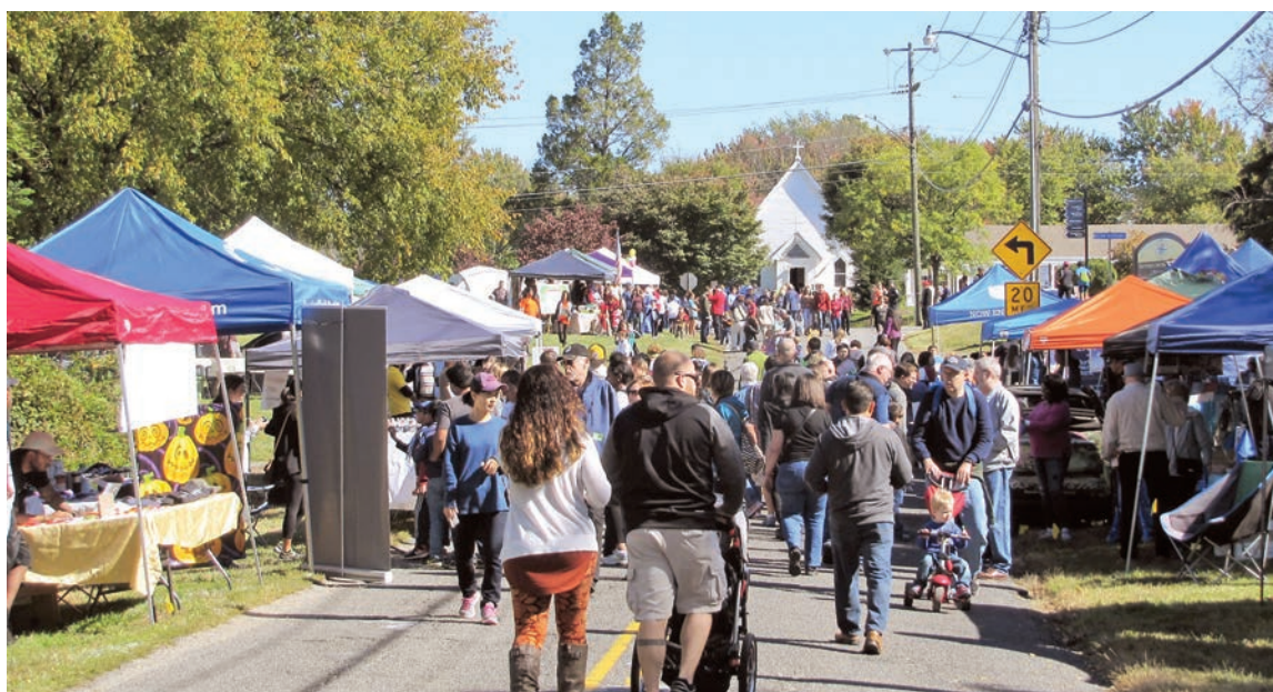
Participants at Centreville Day enjoy vendors as they head down Mt. Gilead Road to learn more about the history of St. John's Episcopal Church.

dialogue and questions. Moderated by the McLean High School Gay-Straight Alliance.