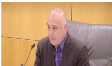
Vice Mayor Cesar del Aguila