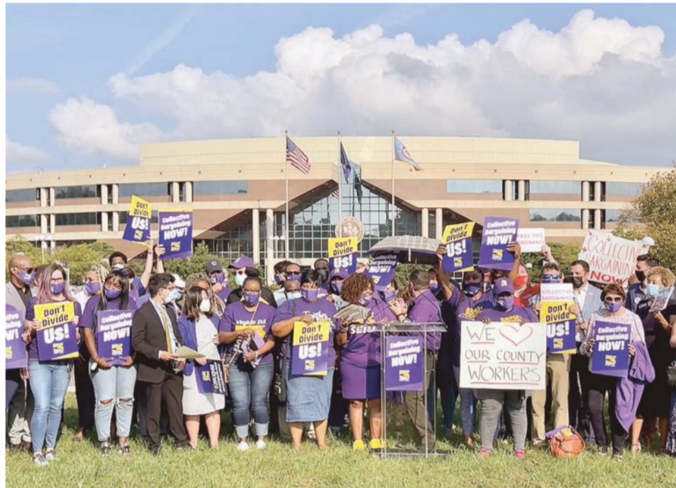
Rallying for Collective Bargaining in front of the Fairfax County Government Center.

“In fact, absolutely nothing about this proposed ordinance directly impacts FCPS in any way. If schools enter into an agreement,