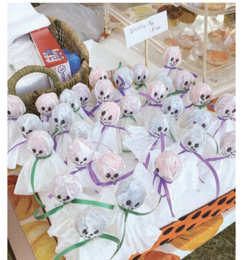
Ghost pops and other baked goods and homemade soups are available at the Immanuel Church-on-the-Hill Pumpkin Patch.

make a difference to the charities that we support so I hope people will come out and support us.”