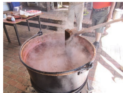
Apple butter turns dark reddish-brown when cooking.