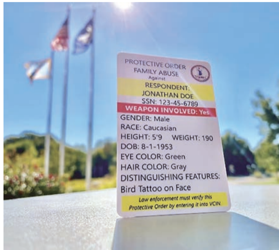
The free laminated, wallet-sized Hope card is a new tool for enforcement of protection orders and a new resource for survivors of family abuse.

As I noted in my column last October, the scourge of family violence has only become more acute with the many hardships and stressors brought on by the