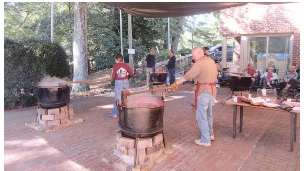
Four stirrers on the Parish House patio stirring and stirring.

IN THE MIDDLE AGES , monasteries produced apple butter as a way to conserve part of the fruit production, reports Wikipedia. In the U.S. South, it also became a common