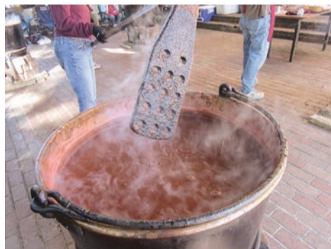
The poplar paddle has holes to enhance mixing.

sets up a horseshoe-shaped operation with a human conveyor-belt system of 10 people on each side who pour the precious product into jars, put on rings and lids and tighten them.