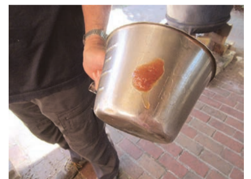
John Pasour did the stainless steel test. It wasn’t done.

way to avoid wasting the fall apple harvest. It is often a family event and opinions vary on the best apple to use.