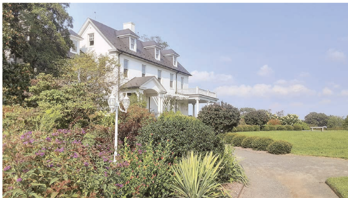
The future of River Farm has dominated the discussion for the past year in Mount Vernon.

AHS is rebuilding and moving forward, "as we rededicate ourselves to the preservation and