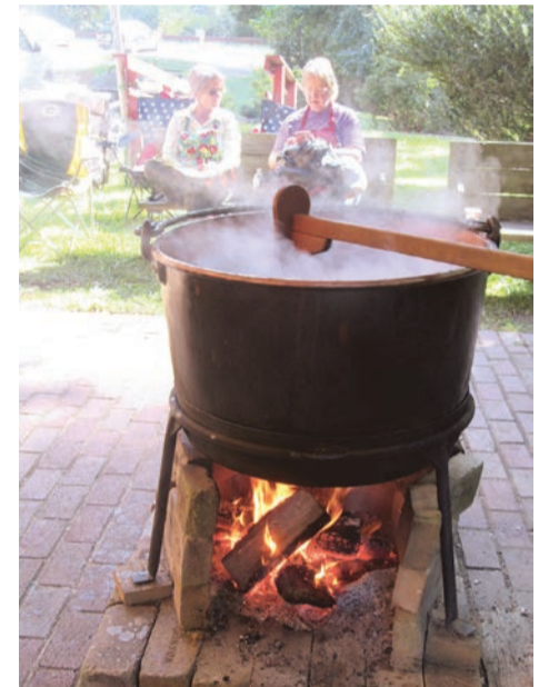
The apple butter cooks in copper kettles on metal stands over oak fires.