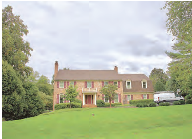
2 12212 Drews Court — $1,850,000