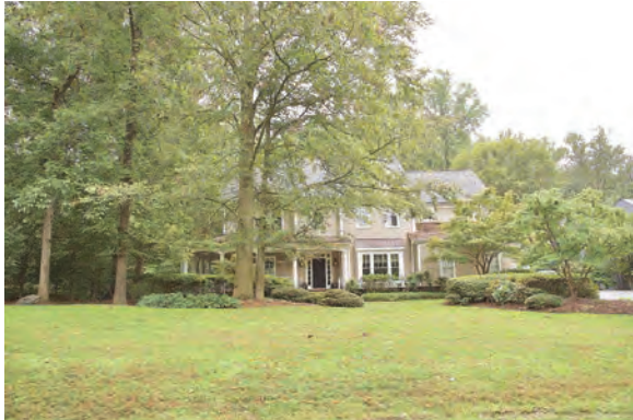
5 11513 Dahlia Terrace — $1,610,000

IN JULY, 2021, 92 POTOMAC HOMES SOLD BETWEEN $2,562,500-$550,000.