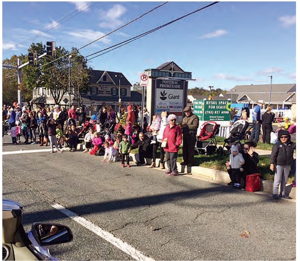
Families line up at the crossroads to see the parade come by.