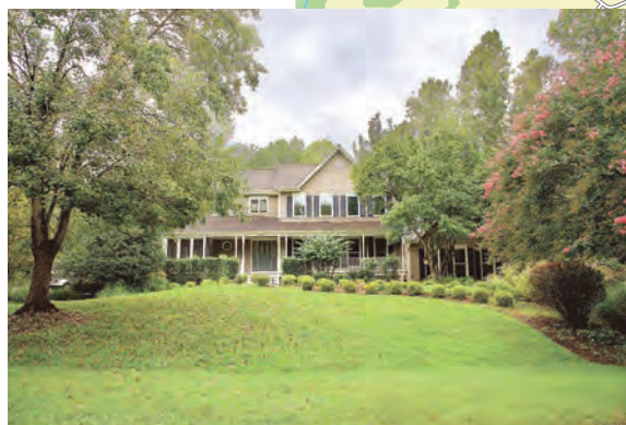
4 6805 Canal Bridge Court — $1,610,000