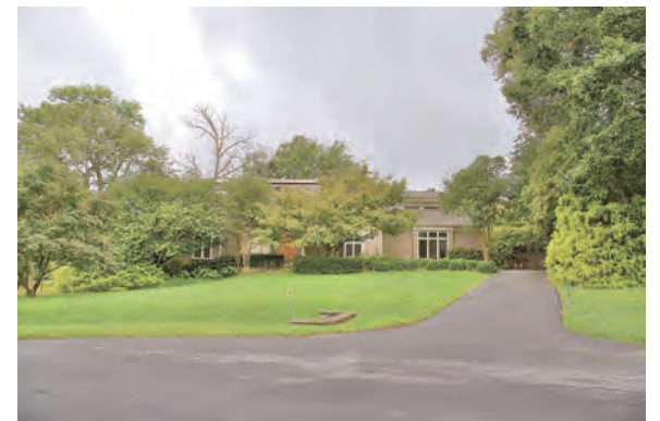
7 10847 Nantucket Terrace — $1,540,000