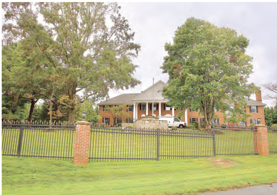
1 8801 Brickyard Road — $1,900,000