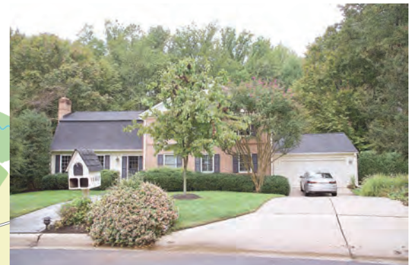
8 10430 Masters Terrace — $1,525,000