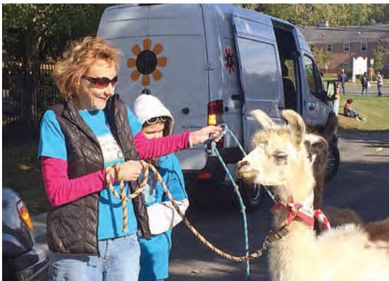
Squeals on Wheels comes with their many adorable creatures.

M ark your calendars for Oct. 23, 2021 because Potomac Day is back with the traditional parade, car show, business fair, and more. Potomac Day provides a chance to gather with friends and neighbors outdoors and at a safe distance, to watch children whiz down giant pumped-up slides, rock to local bands and learn about local organizations and businesses.