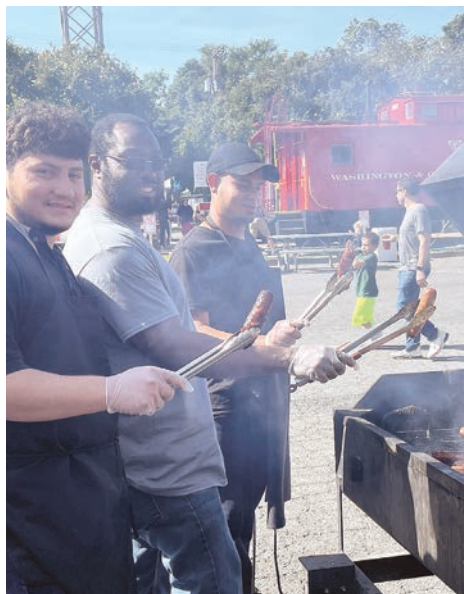
Grilling up smokey brats.