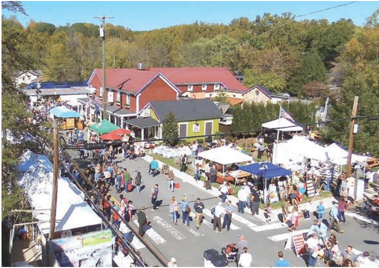
Clifton Day will take place Sunday, Oct. 10, 2021 in the Town of Clifton.