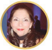
FAIRFAX COUNTY Mercedes Dash