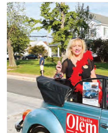
Sheila Olem, mayor of the Town of Herndon.