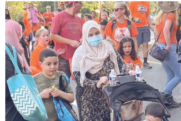
Accompanied by adults and dressed in their Tiger Pride orange, Terraset Elementary School students participate in the South Lakes High School Homecoming Parade.