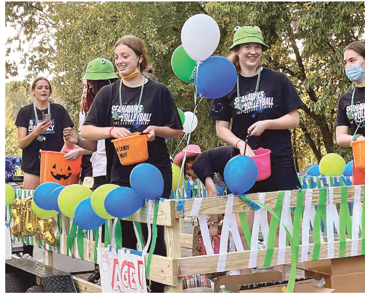
SLHS volleyball team tosses candy to children curbside who are watching the parade.

The visiting Washington-Liberty Generals took host Herndon High School's homecoming win Oct. 16, 49-35, after Herndon scored the first touchdown with a 90-yard run. Later tied at 28, the General's took the lead and headed to victory.