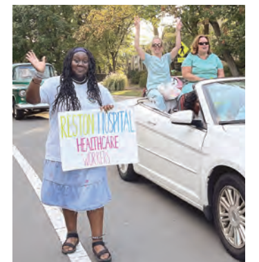
Reston Hospital healthcare workers. The medical staff of Reston Hospital Center provides scholarships to local high school seniors, including those at SLHS, for academic excellence and plans to pursue a career in healthcare.