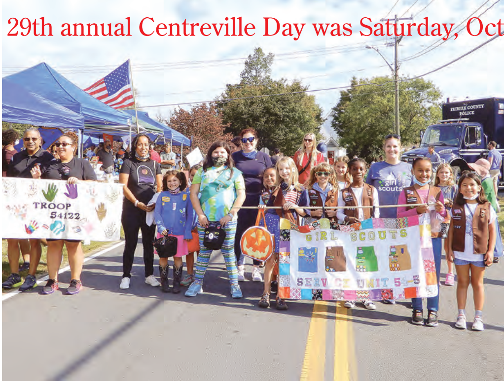
Girl Scouts from Service Unit 54-5.

The 29th annual Centreville Day was Saturday, Oct. 16.