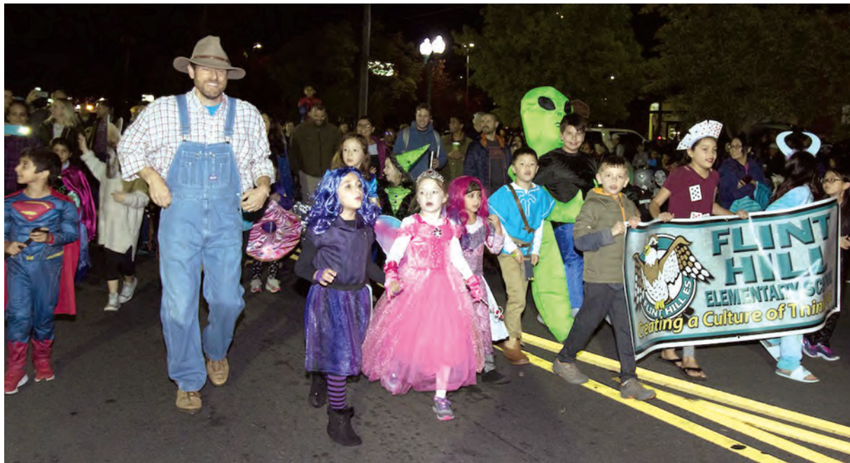
A 75-year tradition, the Vienna Halloween Parade is Oct. 27. This year's theme is the "Roaring 20s."

friends to historic Old Town Alexandria for tricks and treats from your favorite boutiques. Winners receive gift cards from The Dog Park in three different categories. Visit the website: thedogparkva.biz