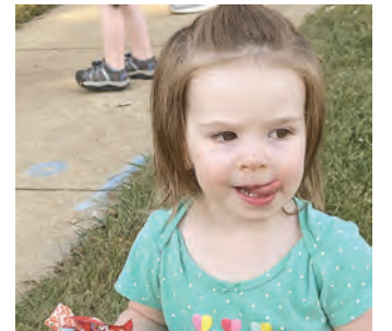
One little girl has her hands full of so many sweets handed to her by SLHS parade participants she can't open any of them. Will she continue the school's Homecoming Parade candy tradition in 2034?