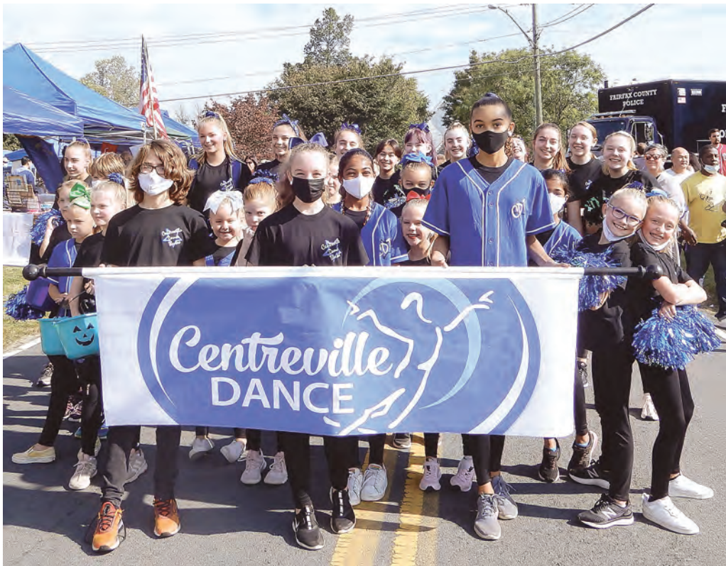
Members of Centreville Dance Academy strike a pose during the parade.