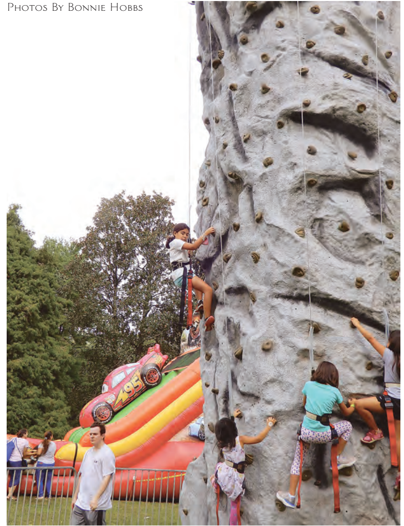
Four girls heading up the climbing wall.