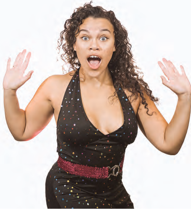
The Disco Musical Comedy - Disaster will be shown at NextStop Theatre in Herndon through Nov. 7.

LuminoCity Festival. 6-9 p.m. At Roer's Zoofari, 1228 Hunter Mill Road, Vienna. The LuminoCity Festival, a one-of-a-kind, immersive light display experience, will be a festive experience for guests of all ages. Be ready to enter a world straight out of your wildest imaginations as you step into an unforgettable spectacular night of lights. The festival includes African, Asian, Arid, and Ancient-themed exhibits of spectacularly lit