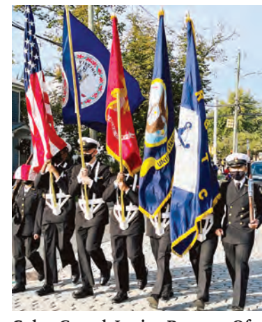
Color Guard-Junior Reserve Officer Training Corps, sponsored by the U.S. Army.