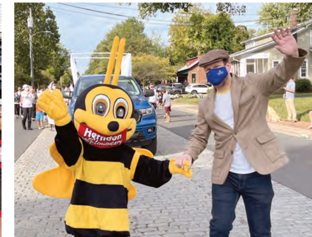
Clearview Elementary School.