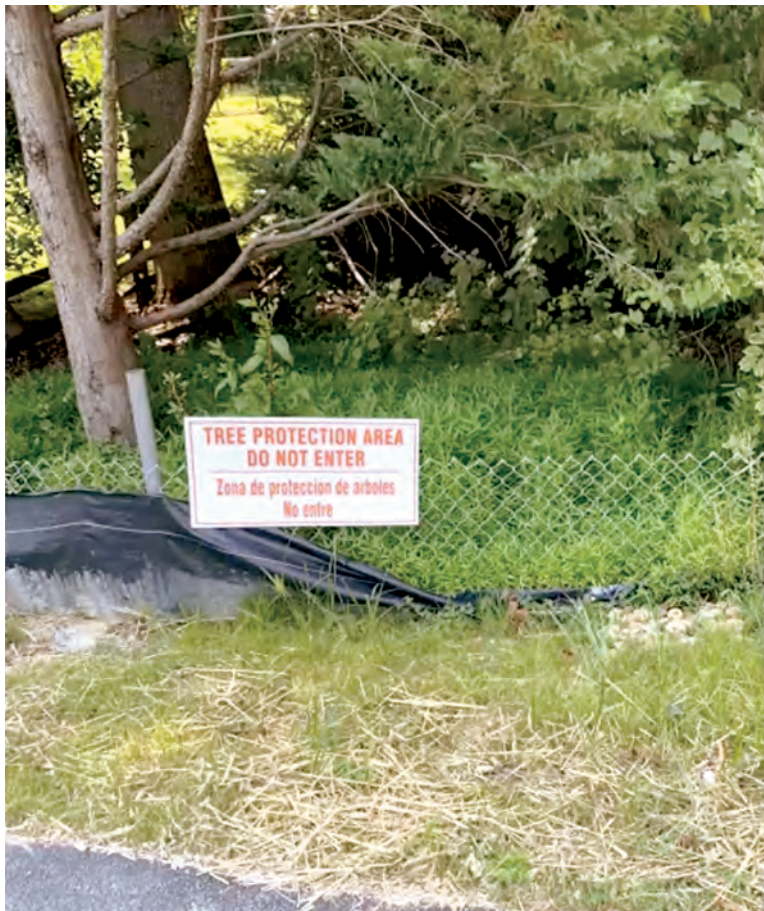
Tree canopy protection as viewed on the video Infill & Tree Canopy Forum on Oct. 19.