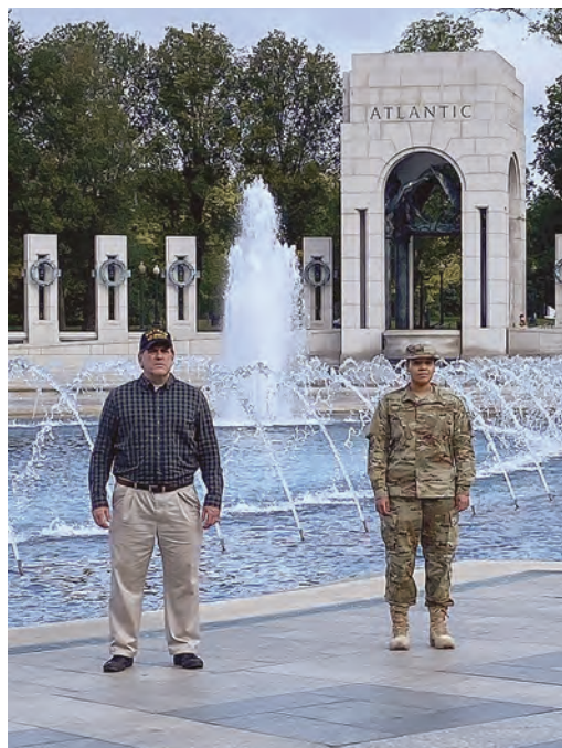
From filming of "UNKNOWN" cast on location at World War II Memorial

For composer Okpebholo, "UNKNOWN" is expansive in its presentation and outlook. "UNKNOWN is not just a White American story. 'Unknown' looks like America. It reflects musically the diversity of those who