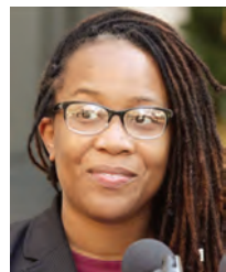
Princess Blanding Liberation Party candidate running for governor raised: $30,000

top contributors $5.6 million from DGA Action $750,000 from Mid-Atlantic Laborers’ Political Education Fund $600,000 from AFSCME $500,000 from Priorities USA $500,000 from Virginia League of Conservation Voters