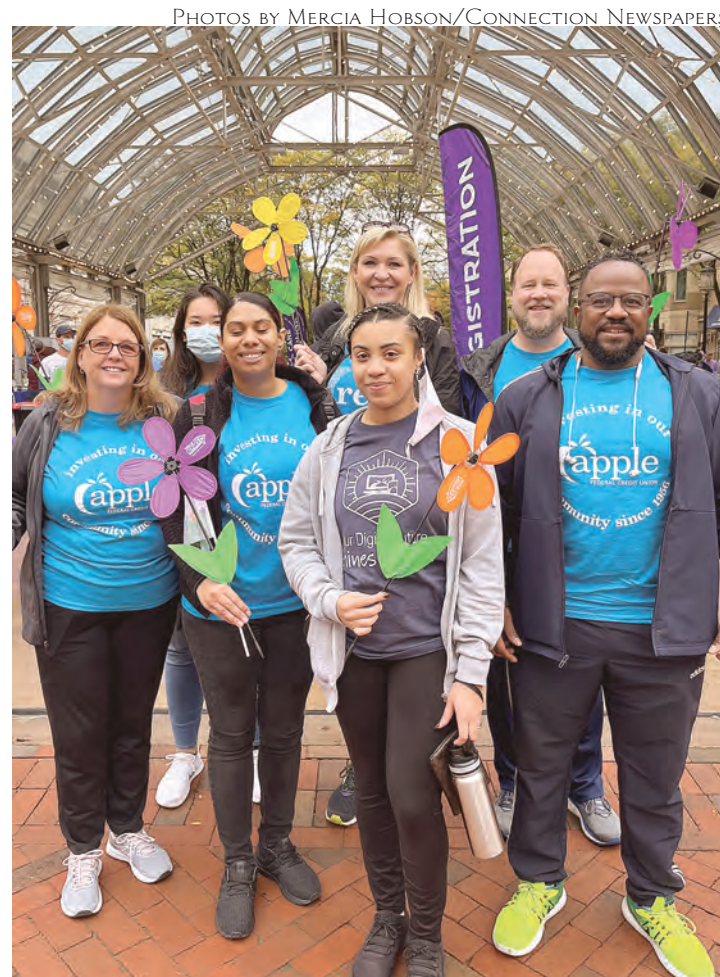
"Alzheimer's is something that affects a member of my family."