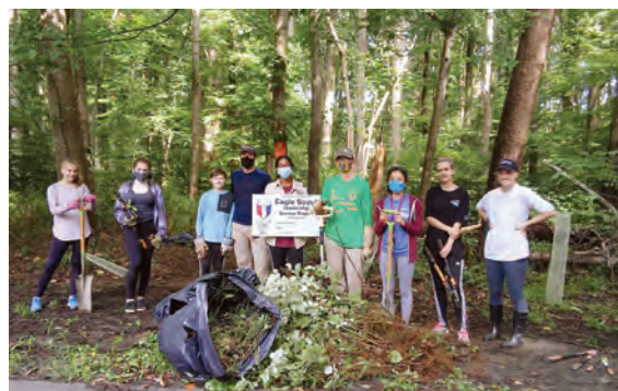
Oakton community volunteers.