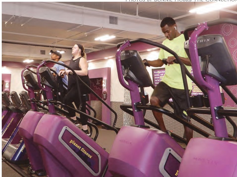
Some of the members working out on the ellipticals.