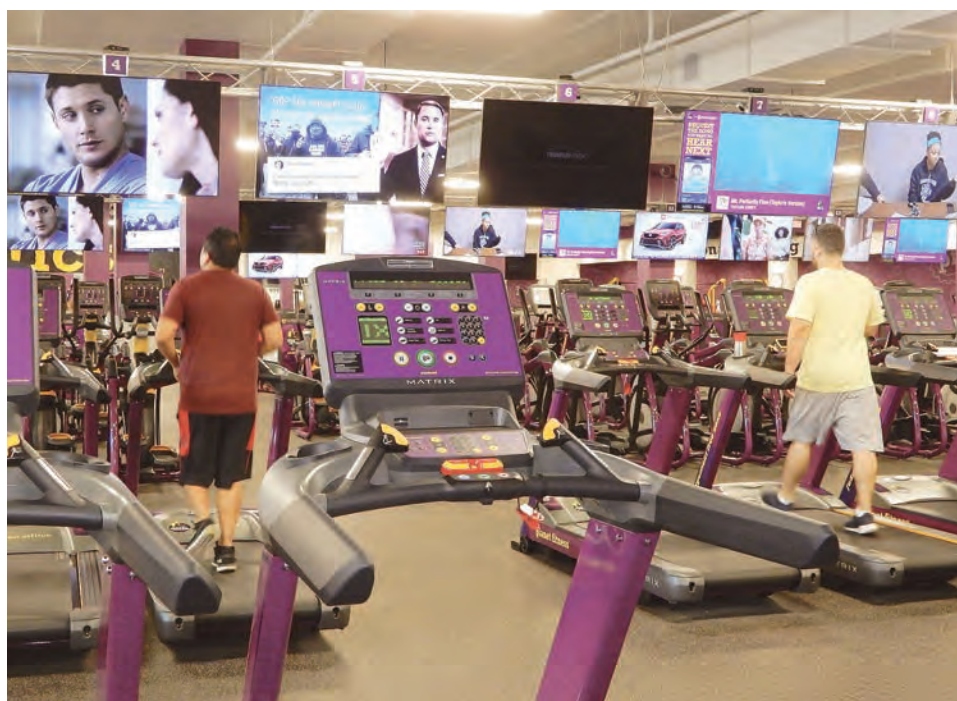
People walking on the treadmills while watching TV.