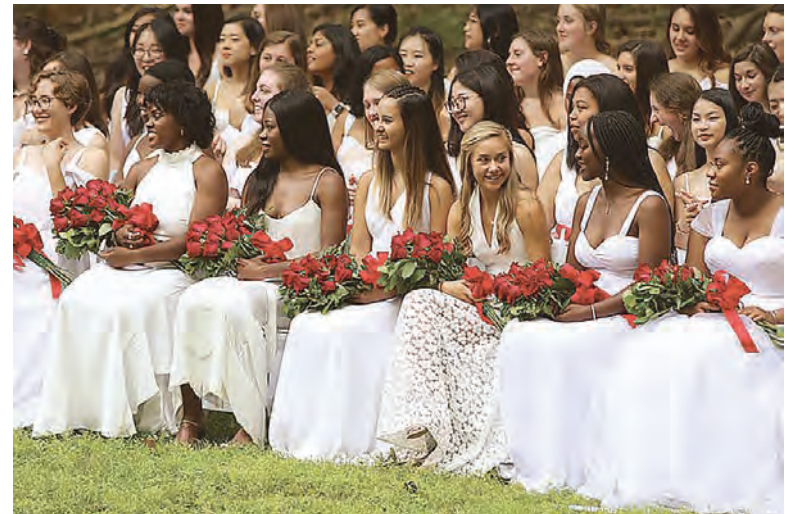
A private school graduation from before the pandemic.