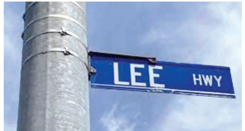
Lee Highway sign in Fairfax County.