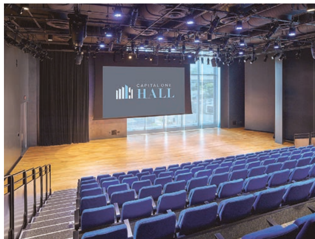
Interior view of The Vault, Capital One Hall

lic-private partnership with Fairfax County." "It is exciting to be one of the first full theatre productions to be mounted in this incredible new space. The intimacy of The Vault is perfect for a warm, family show like 'A Child's Christmas in Wales,'" added Roberts. The production of "A Child's Christmas in Wales" is "a community theatre production with cast drawn from dedicated, talented people in the community."