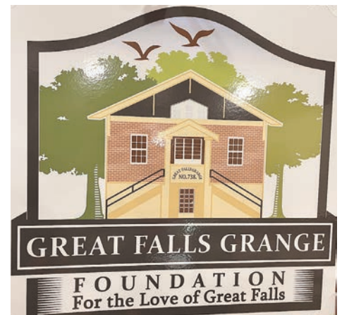
Official logo for the newly recognized [2019] Great Falls Grange Foundation. The grassroots organization seeks to manage and operate the Fairfax County-owned Great Falls Grange No. 738.

hall," as the building needed repairs. After the Park Authority acquired the complex and began operating it as a rental, it discovered it was underutilized and expensive to rent, needing maintenance repair and ADA accessibility upgrades.