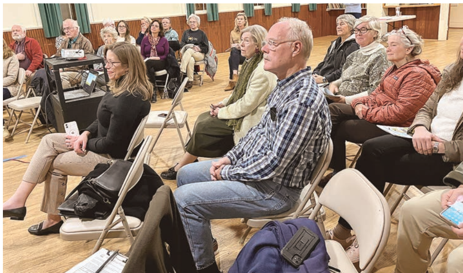
About 40 or so Great Falls locals gathered at the Fairfax County Park Authority-owned Great Falls Grange No. 738 on Nov. 17.