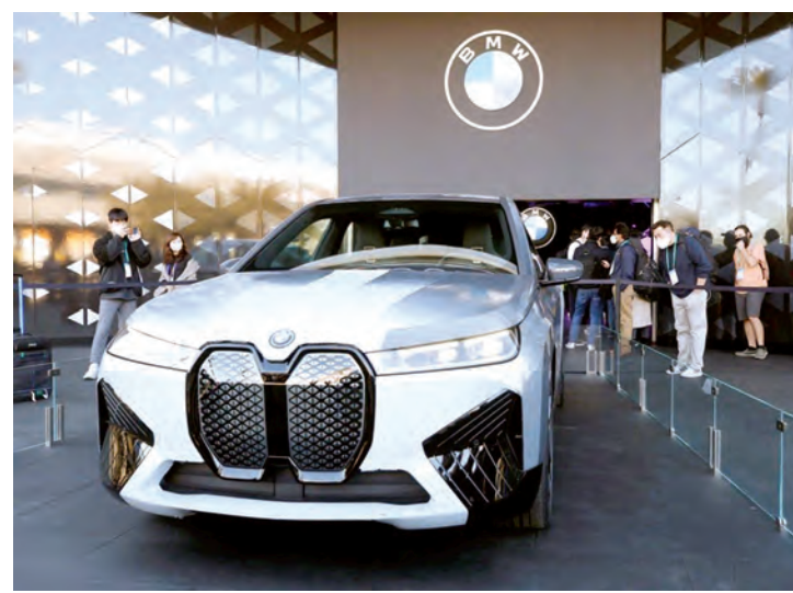
BMW debuted a color-changing electric concept car called BMW iX Flow utilizing E Ink technology. The vehicle can change its exterior color from black to white and shades of grey almost instantaneously.