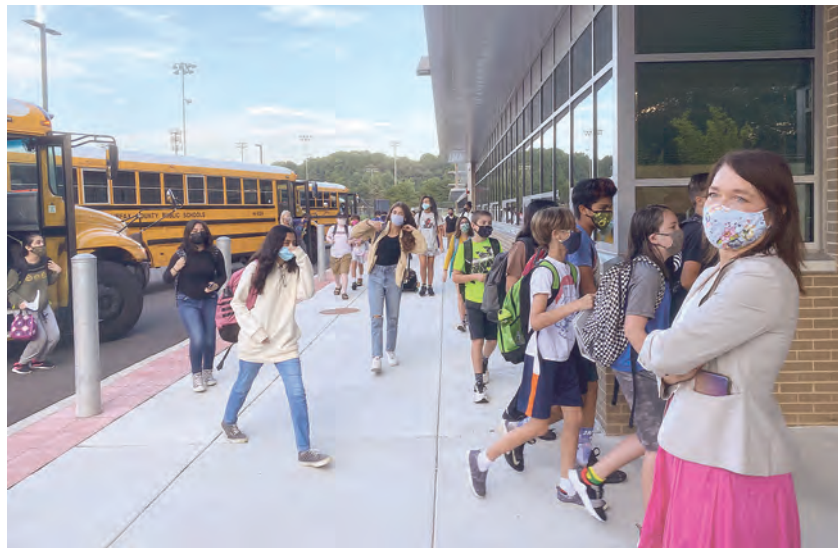
FCPS is resolved to keep schools open.