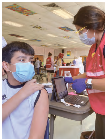
FCPS is urging families to get their children vaccinated as the best protection against Covid-19.

❖ Use FCPS’ diagnostic testing if a student has symptoms.