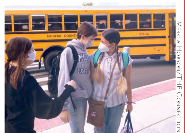
Students return to in person learning in Fairfax County Public Schools.

❖ 5–11-year-old vaccine recipients who are moderately or severely immunocompromised are eligible to receive a third dose of the Pfizer-BioNTech vaccine 28 days after the second dose.