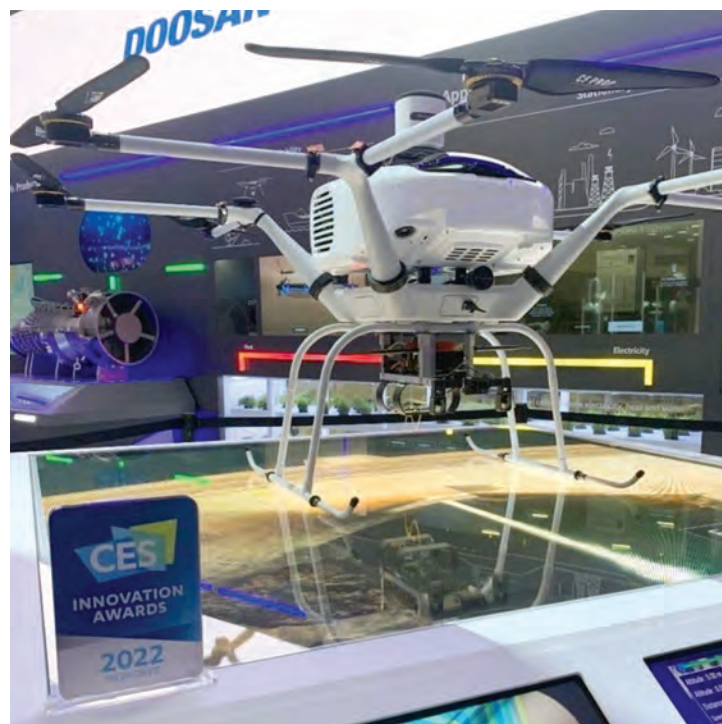
Doosan Mobility Innovation won two CES 2022 awards for its hydrogen fuel cell-powered drone systems.