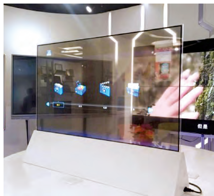
LG Electronics, maker of a transparent OLED concept display, was one of several major exhibitors to pull out of CES 2022 at the last minute due to coronavirus concerns.