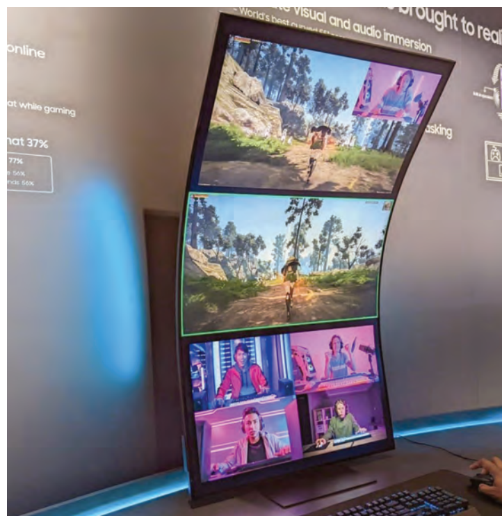
Samsung's 55" Odyssey Ark gaming monitor was unveiled during CES 2022.