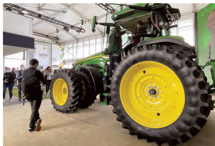
John Deere unveiled a fully autonomous tractor during CES 2022.

Prevalent throughout the show was artificial intelligence, making products and technologies smarter and customizable. Companies included John Deere, featuring the first fully autonomous tractor, and Beyond Honeycomb, with an AI-enabled robot to prep and cook customizable meals.