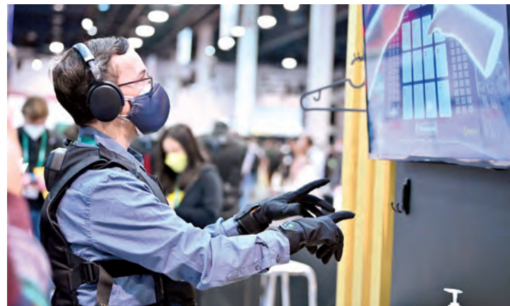
A virtual gaming display at CES 2022.