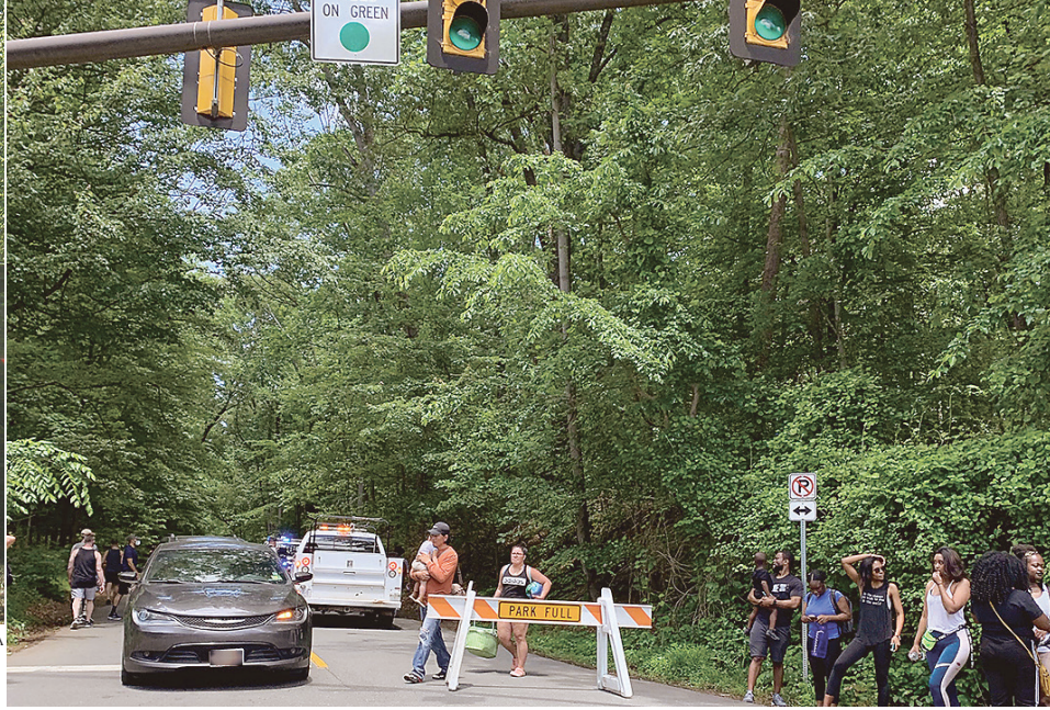
Pedestrians and vehicles entering and exiting Great Falls Park. Parking on Georgetown Pike is no longer permitted.