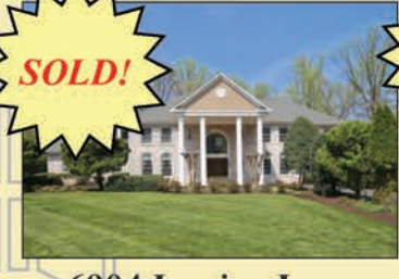
6904 Lupine Lane McLean, 22101 $2,249,000

6293 Columbus Hall Ct McLean, 22101 $1,775,000