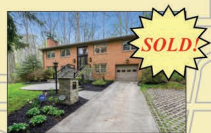
1437 Brookhaven Drive McLean, 22101 $1,099,000

We're seeing multiple contracts with escalations! Call to chat with JD today!