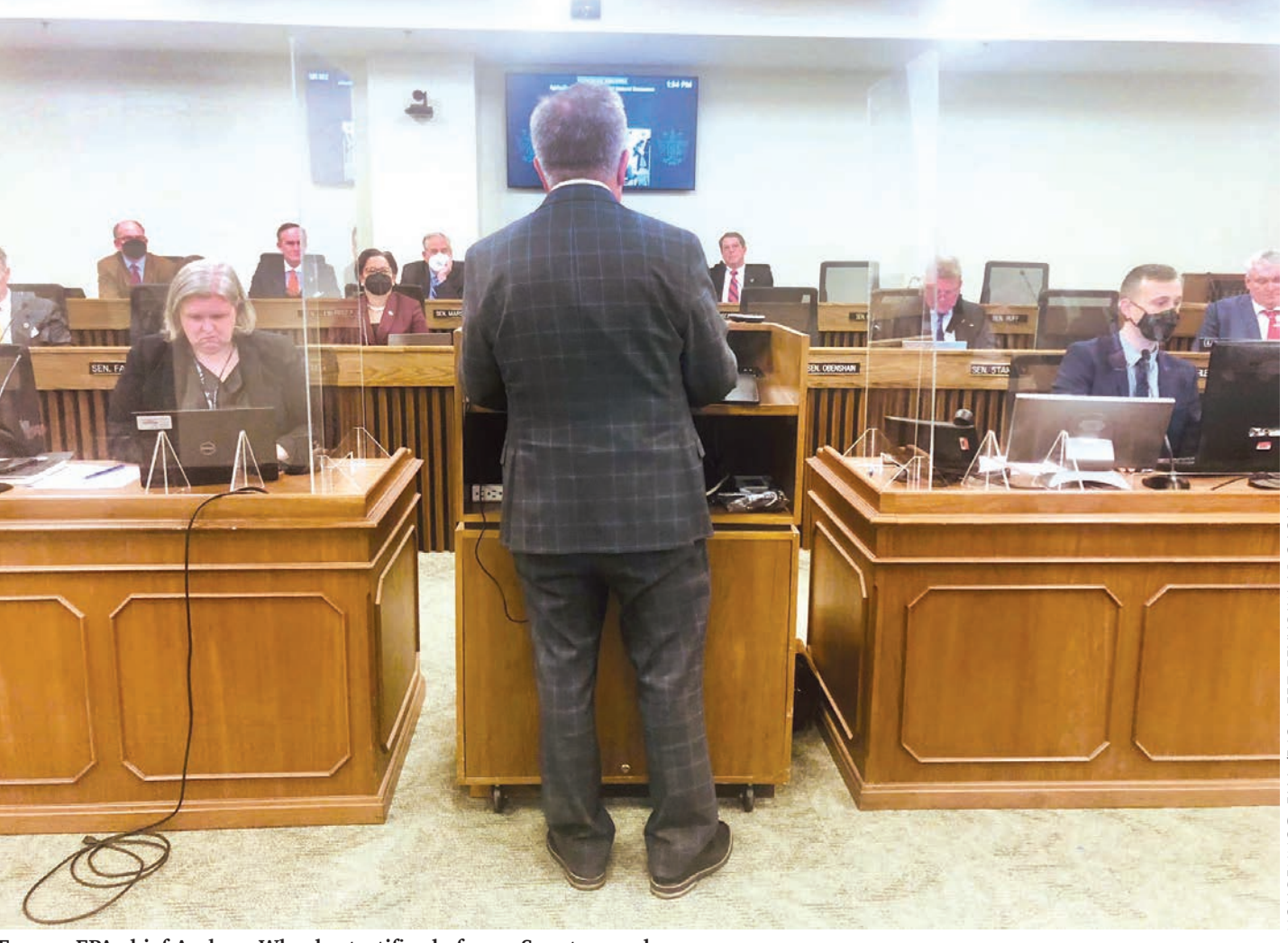
Former EPA chief Andrew Wheeler testifies before a Senate panel.

Senate Democrats are hopeful they'll be able to deny Wheeler the nomination if it gets to the Senate floor, although they have no room for error. Democrats have a one-