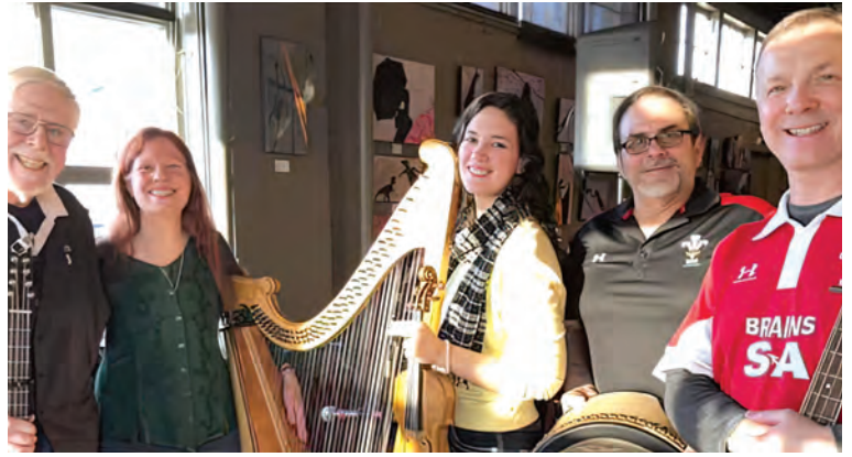
Moch Pryderi, which performs traditional Celtic music, will perform at the Old Brogue Irish Pub in Great Falls on Feb. 13.