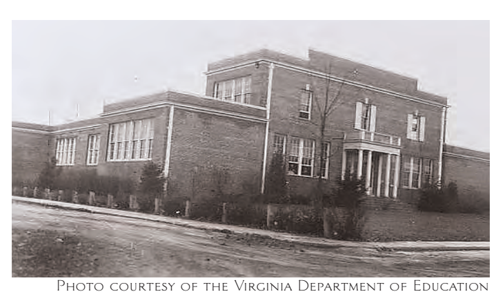
Herndon High School, March 1937.

A romantic dinner at home mends home interior items like throw pillows and home fragrance accessories that are made by small business and women, particularly those that are naturally sourced, eco-friendly and cruelty-free.