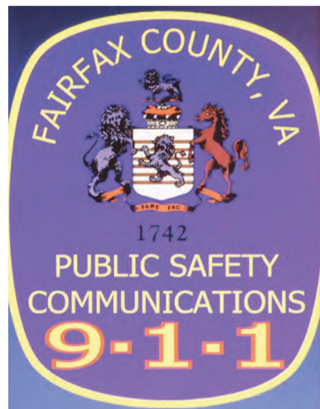
The DPSC logo

“Always There, Always Ready...24/7/365.”