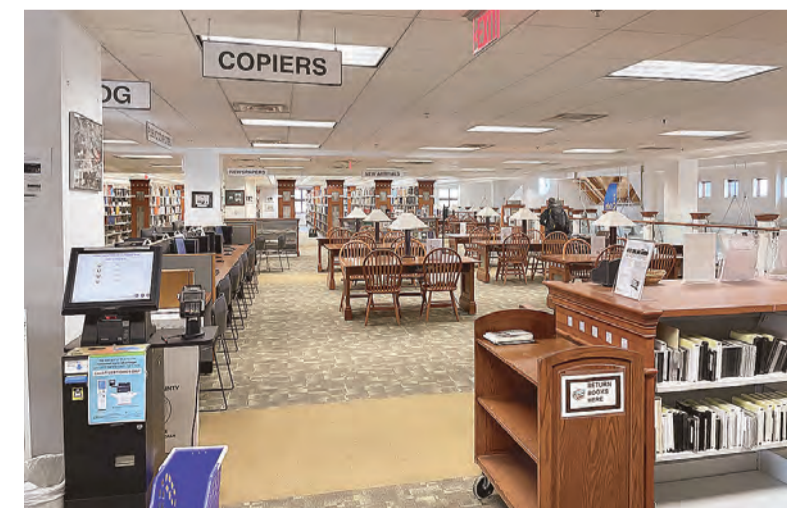
Any copies needed require a credit card.

The Virginia Room is on the second floor of The City of Fairfax Regional Library, 10360 North Street Fairfax, VA, 22030-2514 703-293-6227 option 6 TTY: 711 Send an email to va_room@fairfaxcounty.gov