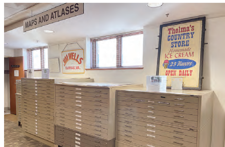
The authentic signs set the mood for historical research.