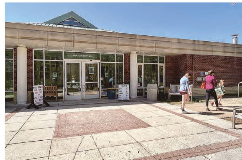
The day before the start of National Library Week, Sunday, April 3 through Saturday, April 9, families stop by the Great Falls Library. www.ConnectionNewspapers.com