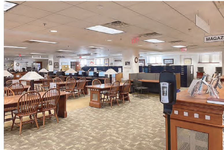
A view from the front desk shows the overhead directional signs.

to the fact that it is open to the first floor. There are sections for periodicals, microfilm and historical books. The room is decorated by historical signs hanging on the walls to give a real historic feel for the place, including Thelma's Ice Cream from Great Falls.