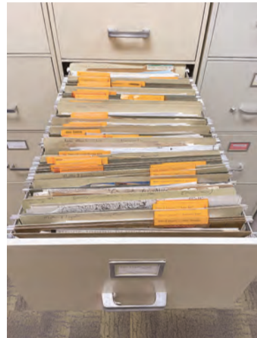
The first set of files in this drawer is "Myths and Legends," like the Bunyan Bridge for example.

The Virginia Room is on the second floor of The City of Fairfax Regional Library, 10360 North Street Fairfax, VA, 22030-2514 703-293-6227 option 6 TTY: 711 Send an email to va_room@fairfaxcounty.gov