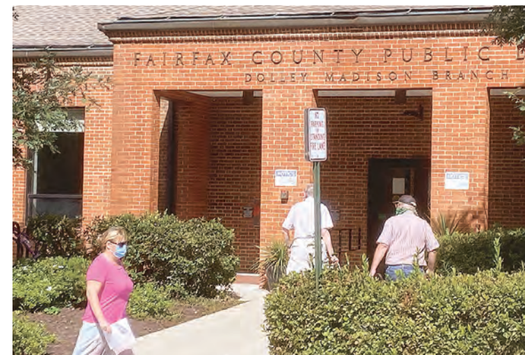
Families stop by Dolley Madison Library. (File photo)