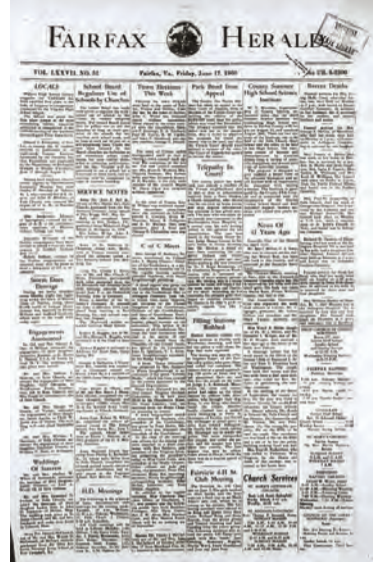
Restoring the Fairfax Herald is one of the more recent projects.