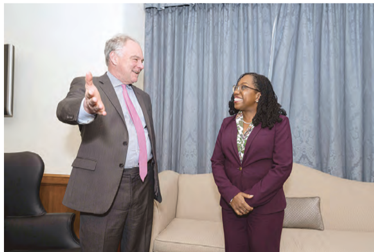
On Monday, April 4, Sen. Tim Kaine met with President Joe Biden's Supreme Court nominee Judge Ketanji Brown Jackson, who would be the first Black woman to serve on the Supreme Court if confirmed.