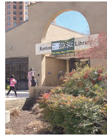
The day before the start of National Library Week, Sunday, April 3 through Saturday, April 9, families flock to the Reston Regional Library for its Friends of the Reston Regional Library 2022 Spring Kids, Young Adults, and Educators Sale.

Food for Others is unable to accept donations of items that are expired, opened items, food that is not labeled, homemade items, cooked food, or toiletries