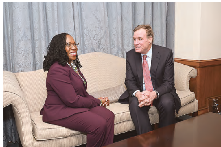
U.S. Sen. Mark R. Warner (D-VA) said he intends to support Judge Ketanji Brown Jackson's nomination to the Supreme Court.

The devil is in the details as is the case in many proposals, and the Governor needs to consider those details and give the General Assembly the opportunity to pass a responsible budget.